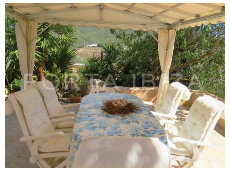
dinner terrace-charming finca-benimussa-ibiza