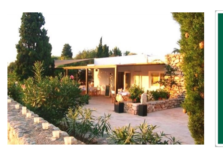
Roca Llisa search for property IBI-101460