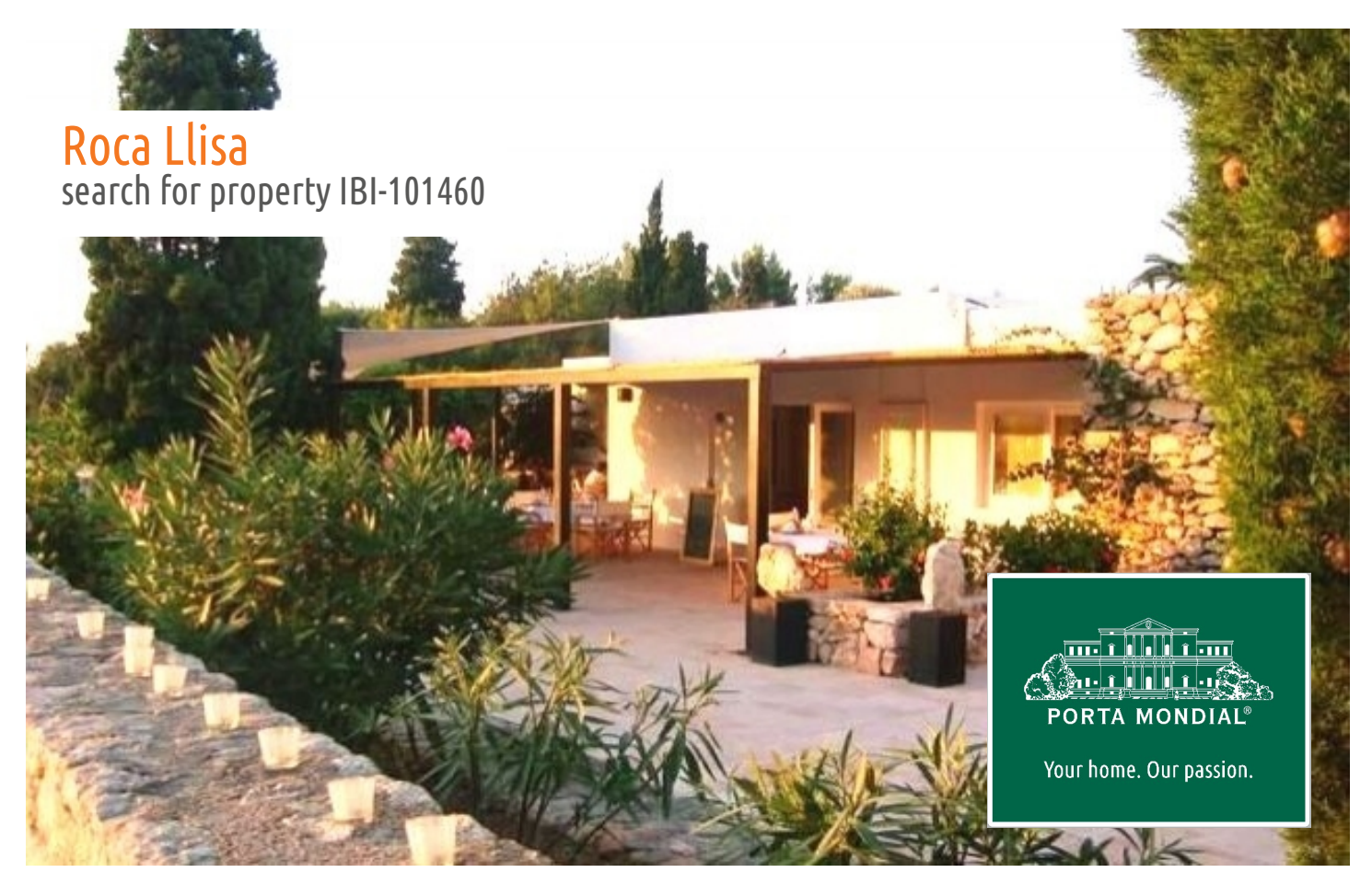
Lovely finca in Roca LLisa with possibility of extension