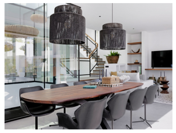
Elegant dining area