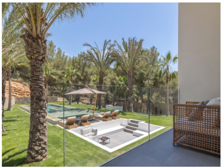
Very nice garden