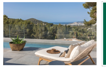
Can Furnet search for property IBI-070012