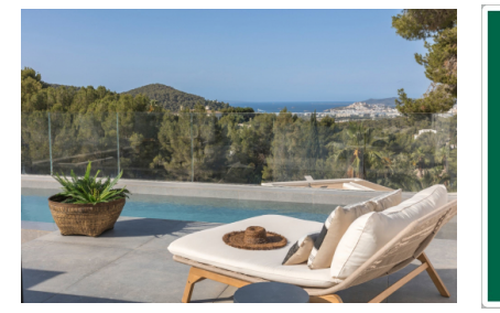
Can Furnet search for property IBI-070012