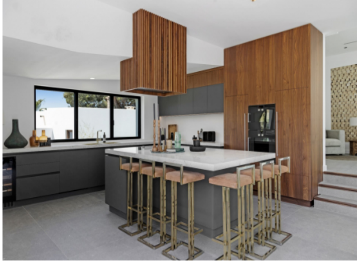
Modern kitchen with large kitche island