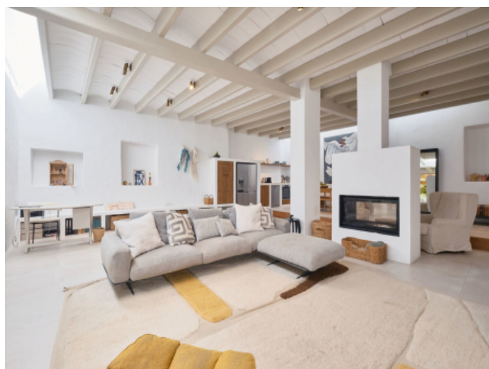
Spacious living area