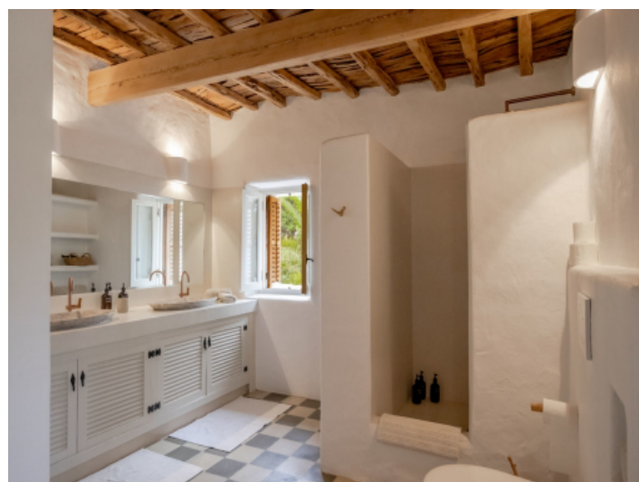
Villa with 8 bathrooms