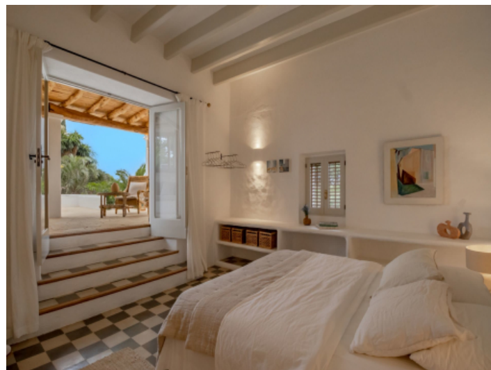
One of 8 bedrooms