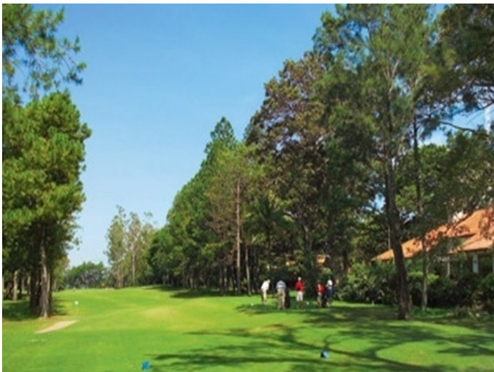
Golf Court within the community area