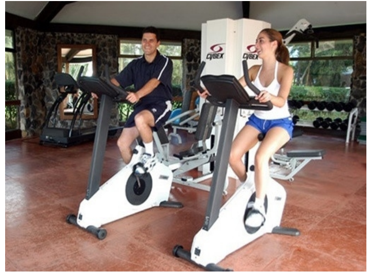
Gym within the community area