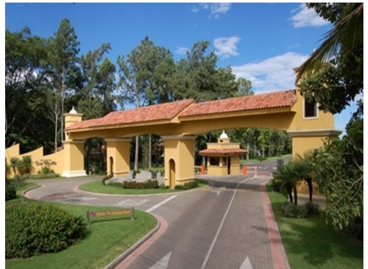
24hour Security Service