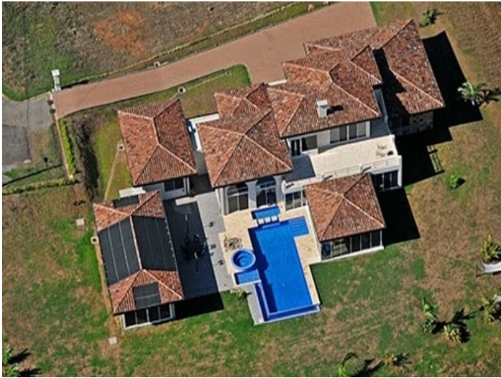
Overview of the property