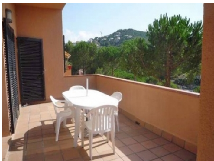
Terrace with great views of the mountains