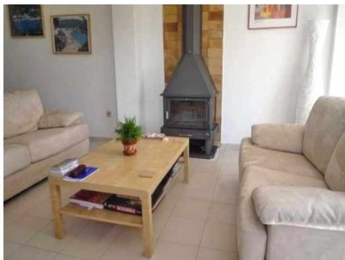
Living room with fireplace