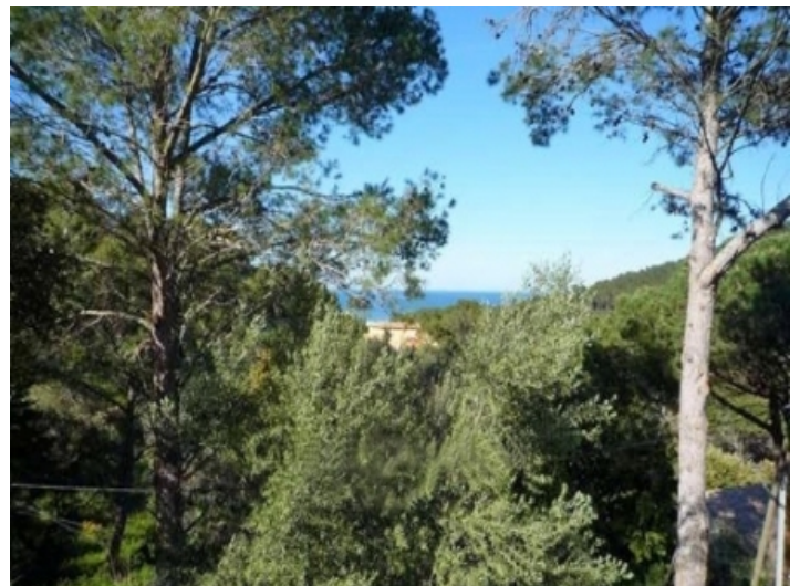
Captivating sea views