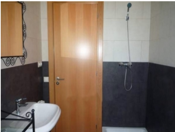
One of the 2 quality bathrooms