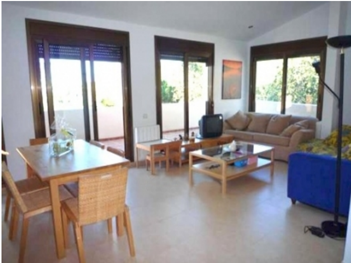
Spacious lounge and dining room