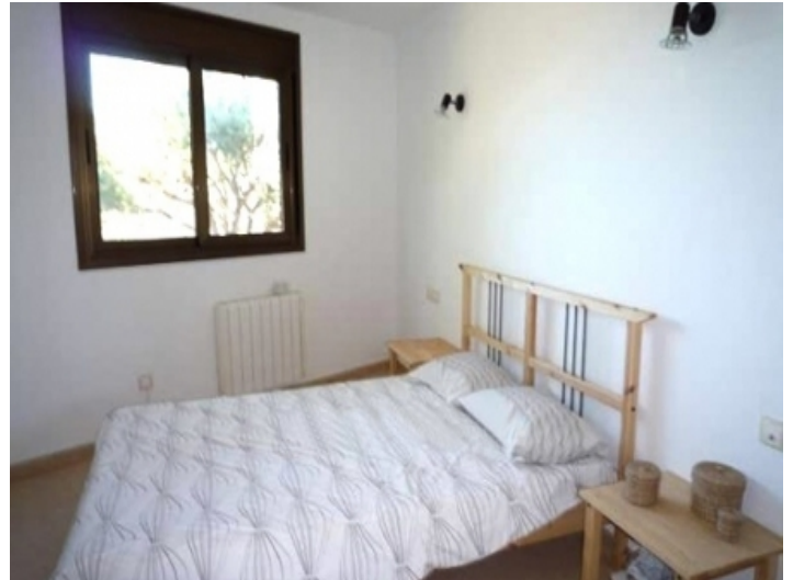
One of the 4 bright bedrooms