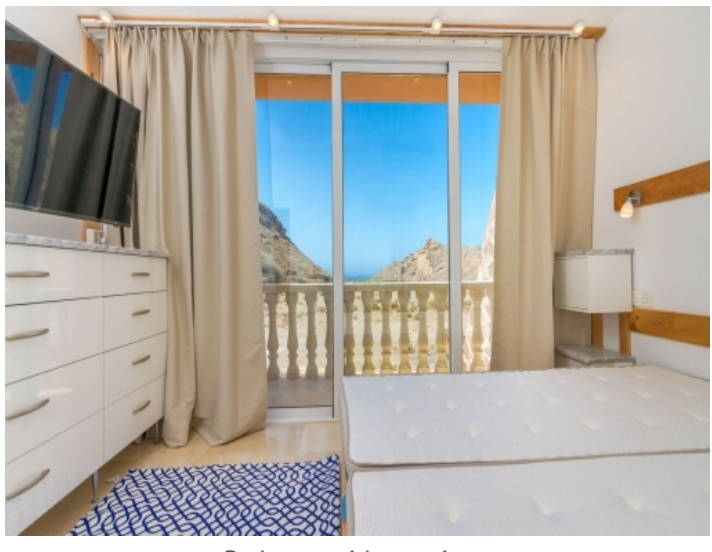
Bedroom with sea views

PORTA MONDIAL CANARIES • C./ COLOM 20 1°, 07001 PALMA DE MALLORCA, SPAIN TEL.: +34 971 720 164 • CANARIES@PORTAMONDIAL.COM • WWW.PORTAMONDIAL.COM/EN/CANARIES/