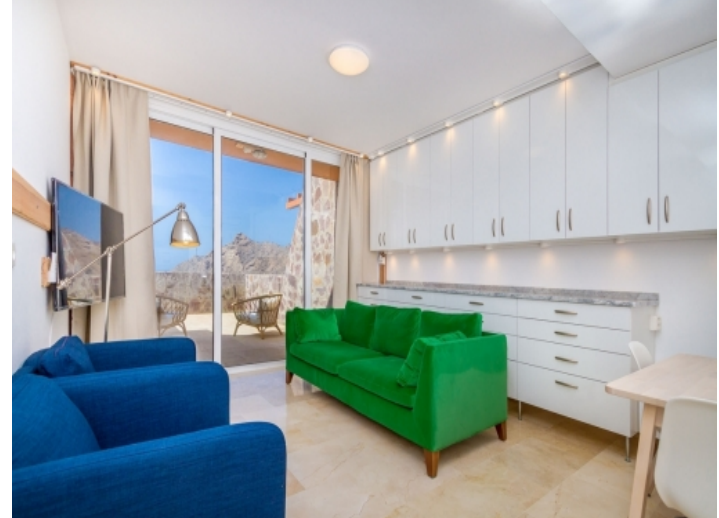
Living area with access to the terrace