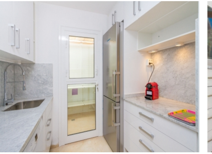
Kitchen with utility room