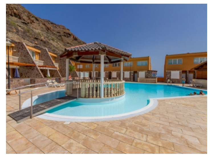
Large community pool area