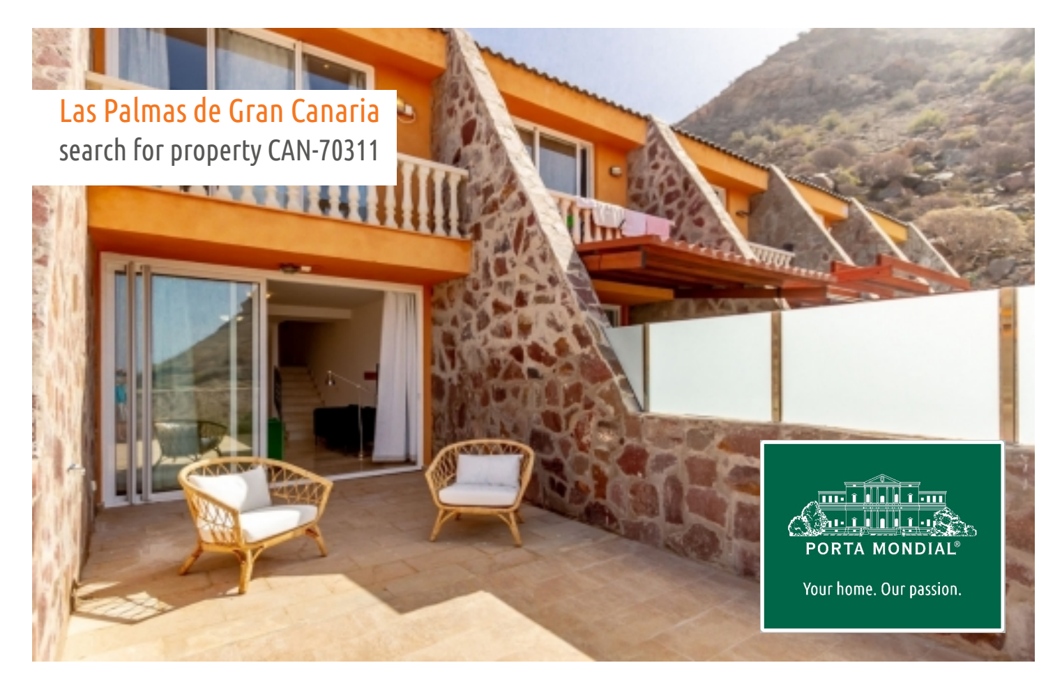
Terraced duplex apartment with sun terrace in Tauro