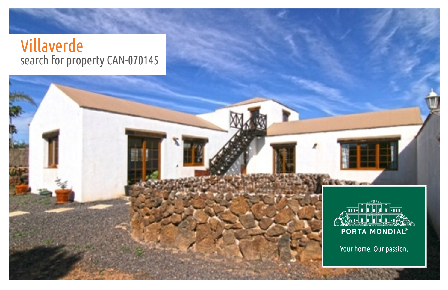
Unique villa with fantastic views in Villaverde