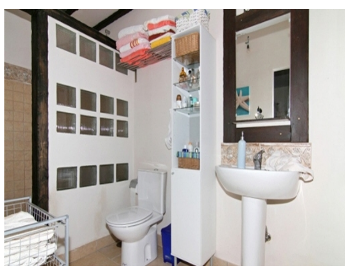
One out of 3 bathrooms