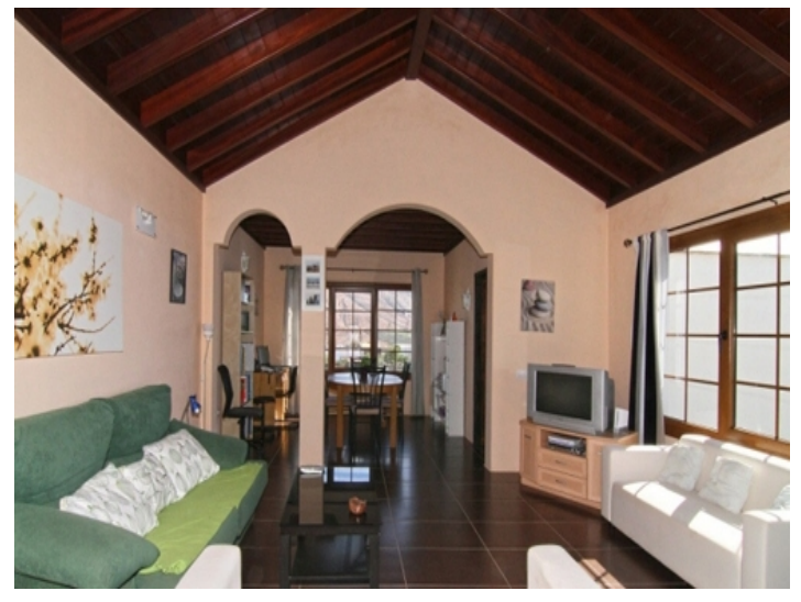
Spacious living area