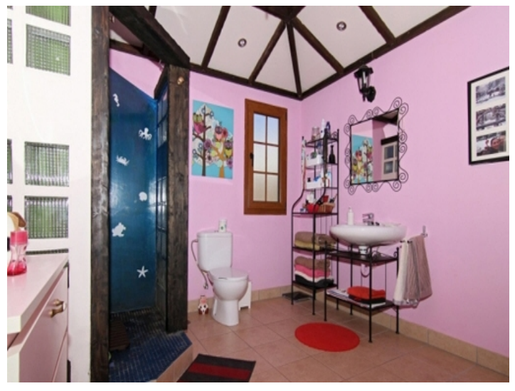
One out of 3 bathrooms