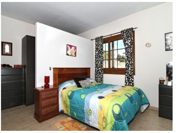
One out of 4 bedrooms