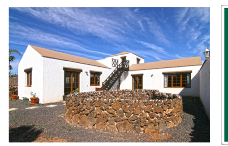
Villaverde search for property CAN-070145