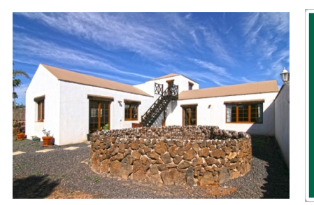
Villaverde search for property CAN-070145