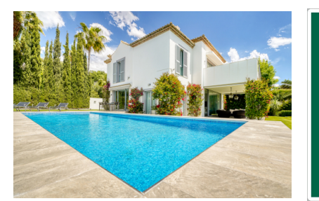
Sotogrande search for property AND-119859