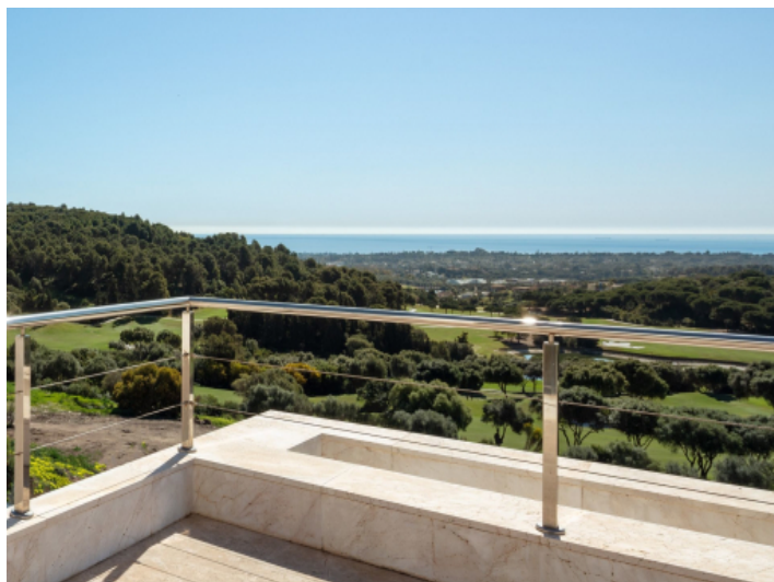
Sunny terrace with splendid views