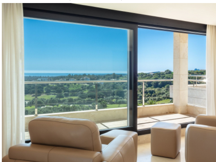
Living area with a panoramic view