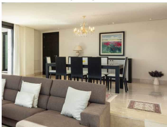
Large living and dining area