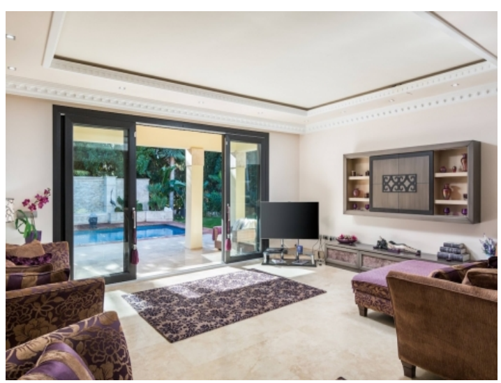
Living area with access to the terrace