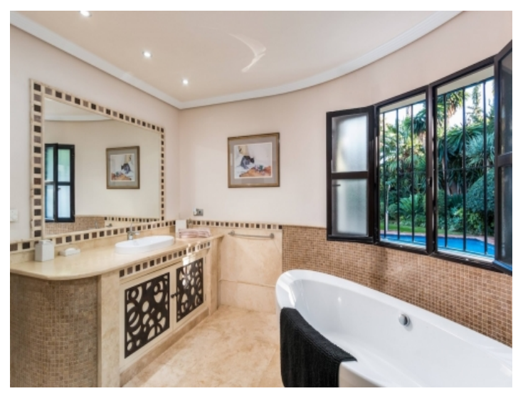
Alternative view of the bathroom