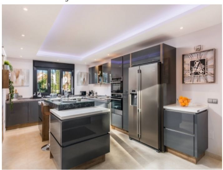
Fully equipped designer kitchen