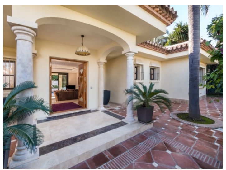
Impressive entrance area