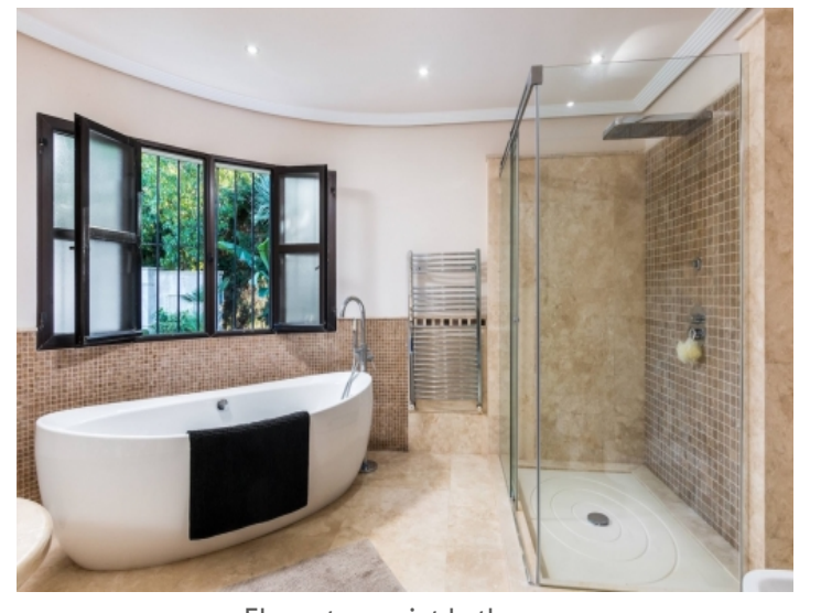
Elegant en suiet bathroom