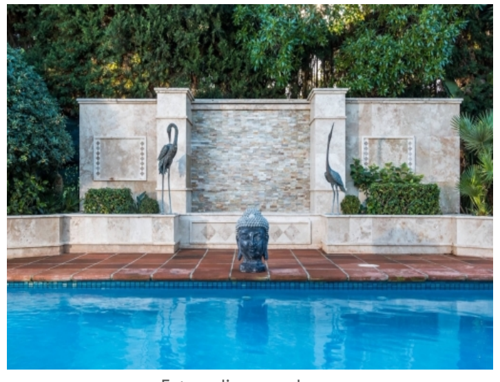
Extraordinary pool area