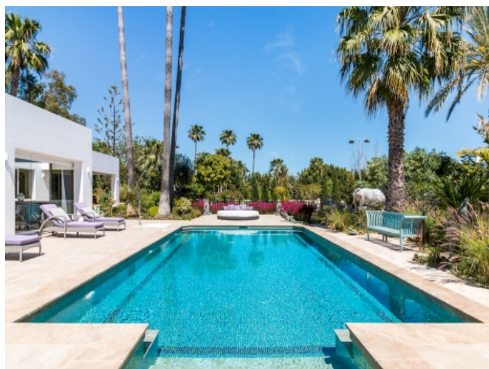
Magnificent villa with large garden in Estepona