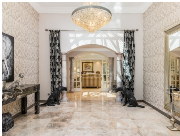
Unique entrance area