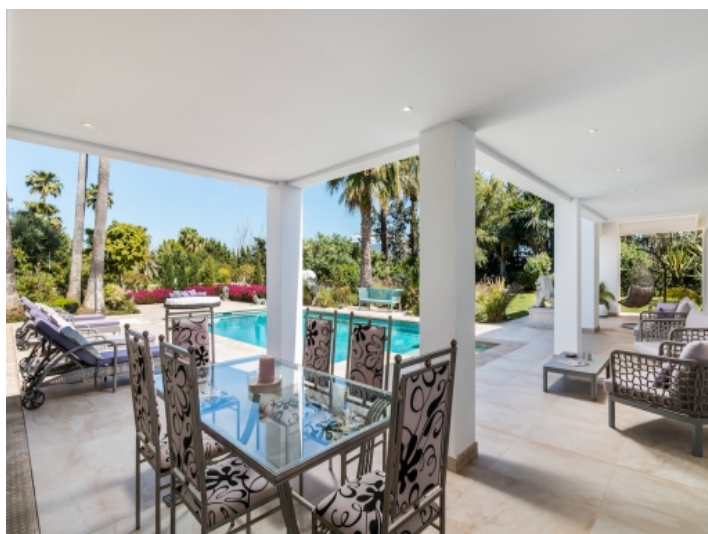
Charming terrace with dining area