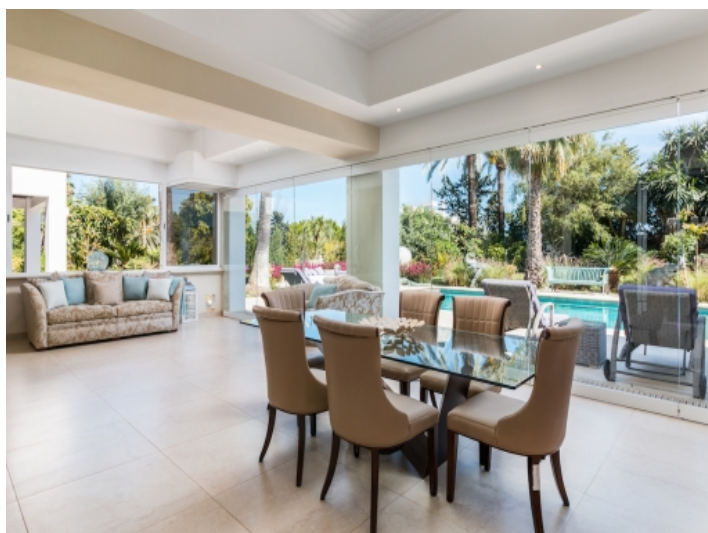
Further dining area