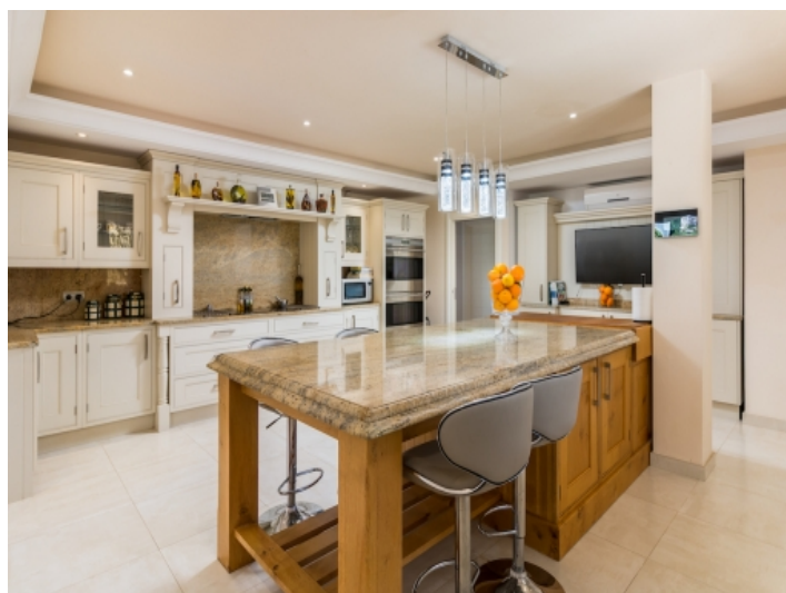
Large, fully equipped kitchen