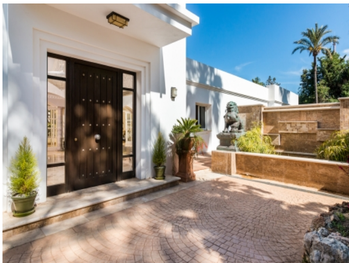
Entrance of the villa