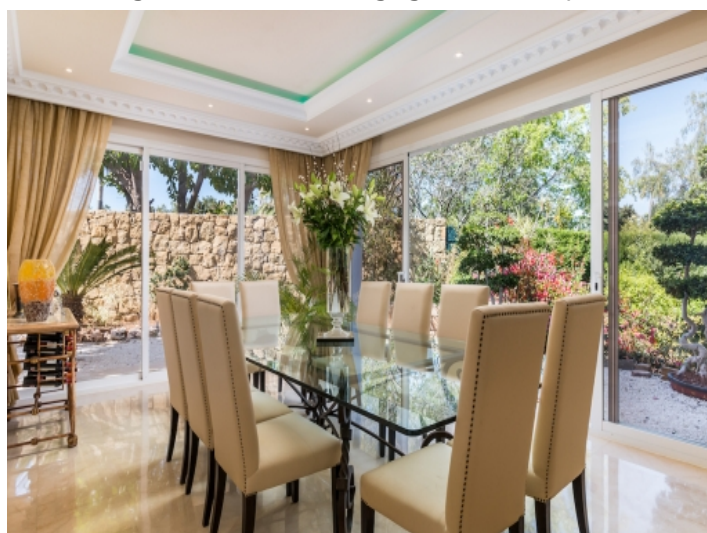
Dining area with panoramic windows