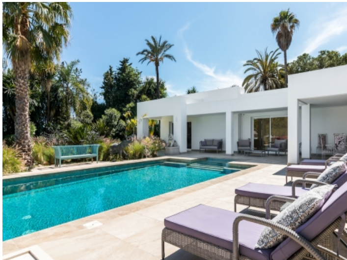
Pool area with cosy sunbeds