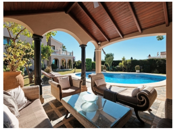
Comfortable lounge area with view to the pool