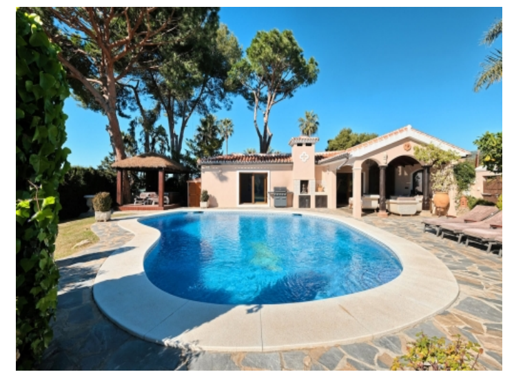
Sunny pool area in the garden