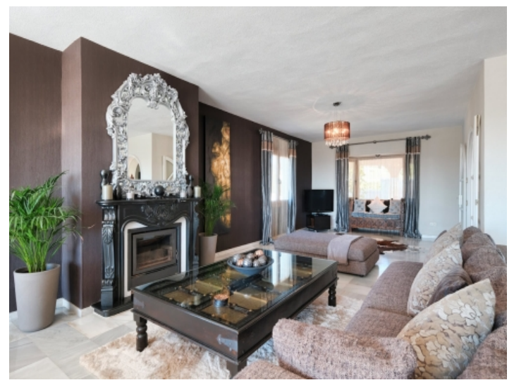
Alternative view of the living area with fireplace