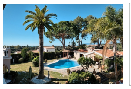
Elviria search for property AND-119683