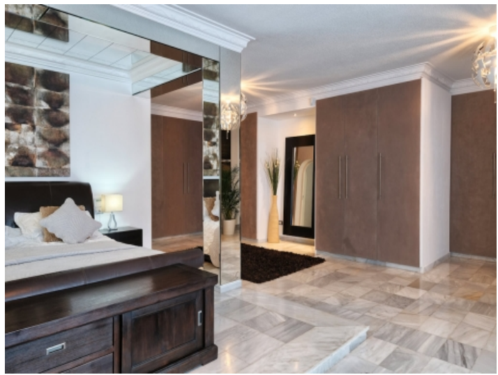
Master bedroom with built-in wardrobe