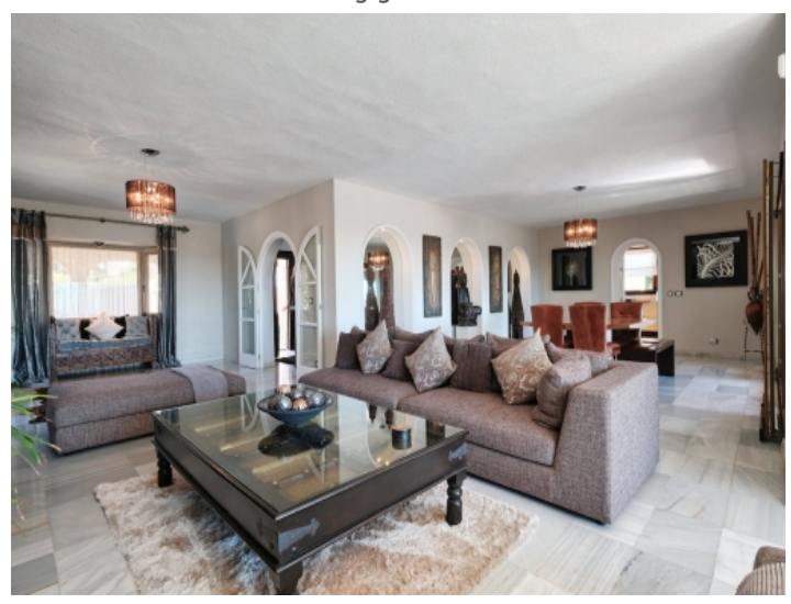
Light-flooded living area