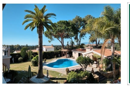
Elviria search for property AND-119683