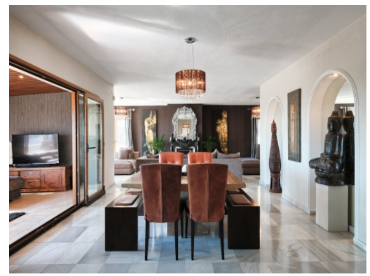
The dining area offers space for up to 4 people

PORTA MONDIAL ANDALUSIA • C./ COLOM 20 2°, 07001 PALMA DE MALLORCA, SPAIN TEL.: +34 971 720 164 • ANDALUSIA@PORTAMONDIAL.COM • WWW.PORTAMONDIAL.COM/EN/ANDALUSIA/