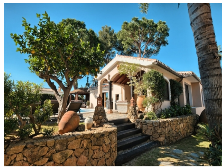
Inviting garden area