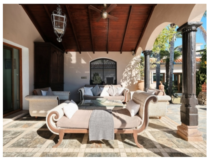
Covered lounge area