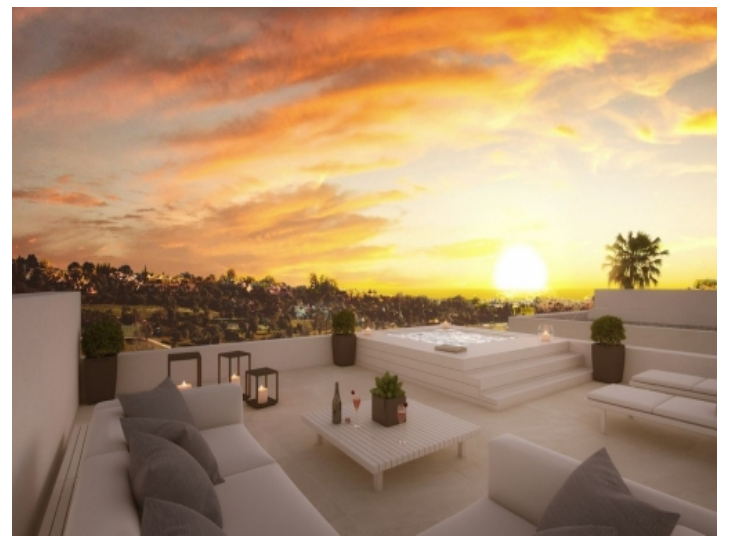
Roof terrace with jacuzzi and impressive open views