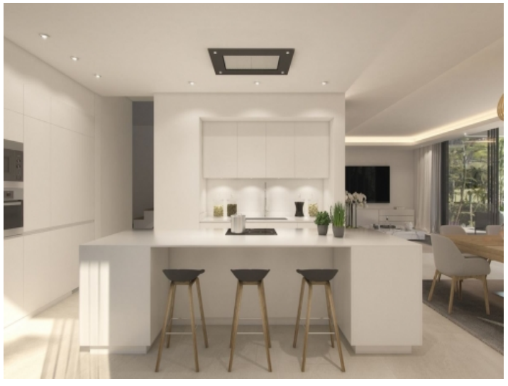
Modern and fully equipped kitchen