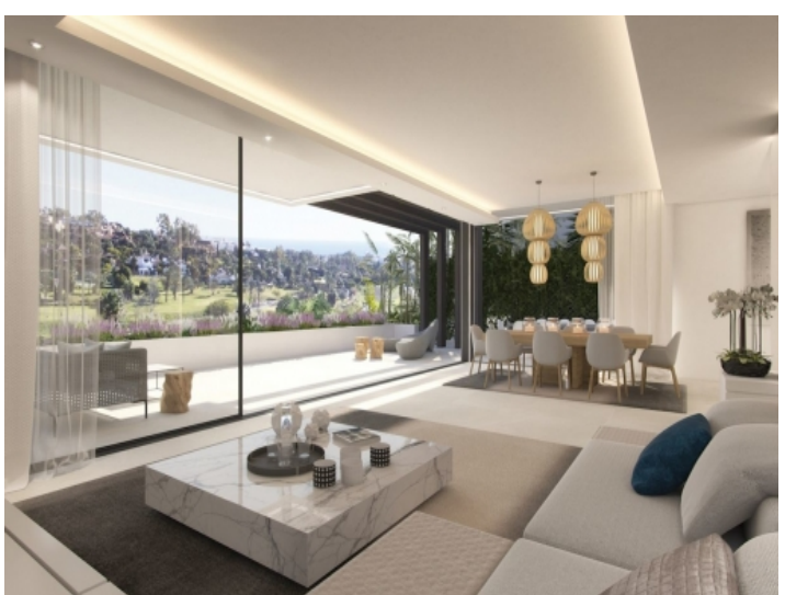
Light-flooded living and dining area