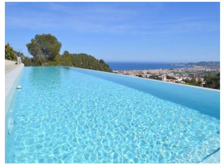
pool area pool