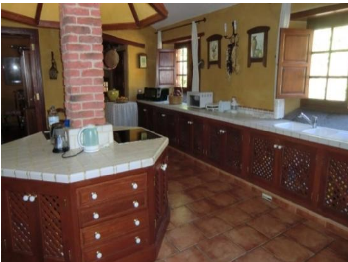
Spacious kitchen with cooking island and white tiled worktop