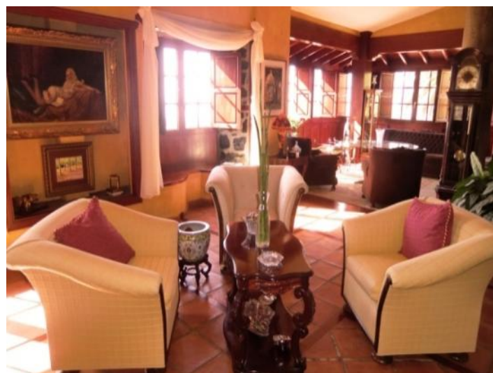
Stylishly furnished living area