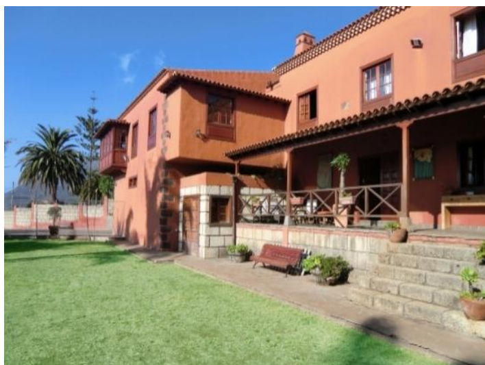
Stately Home with covered Terrace