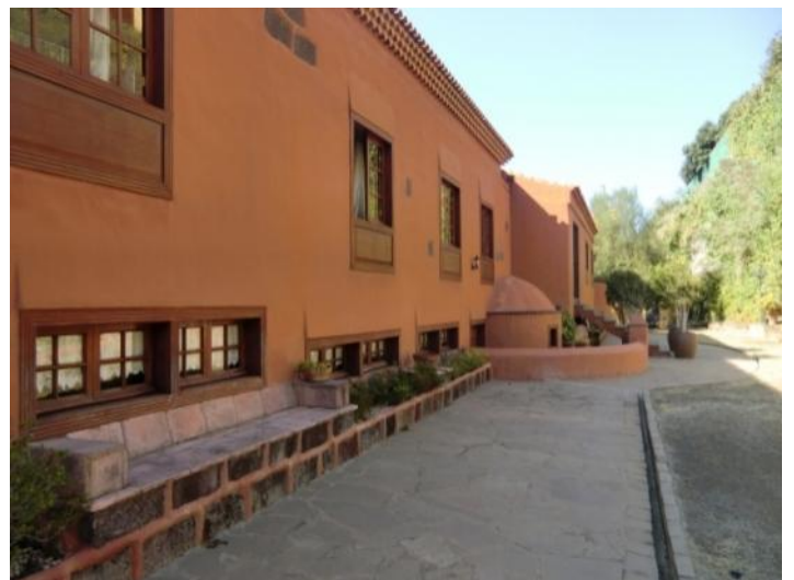
Stylishly designed path with polygonal slabs