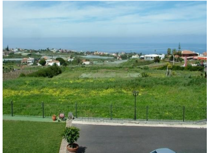
Impressive view of the sea