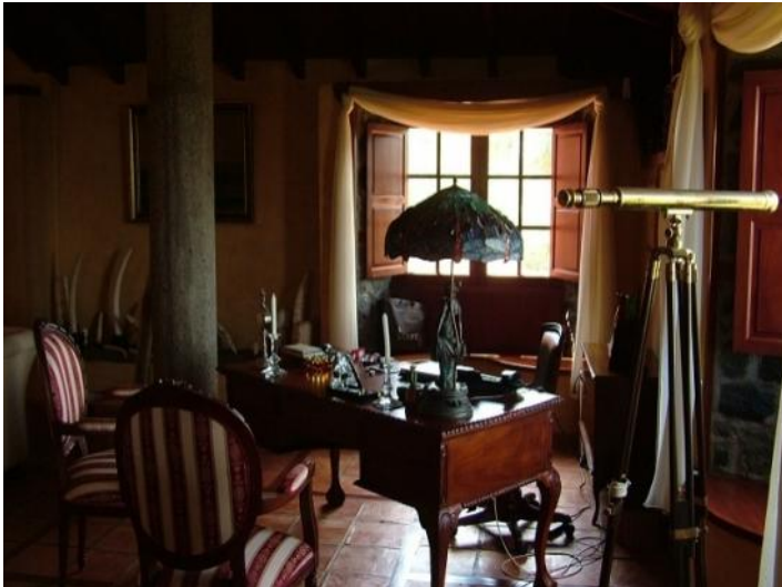
Traditional Canarian study