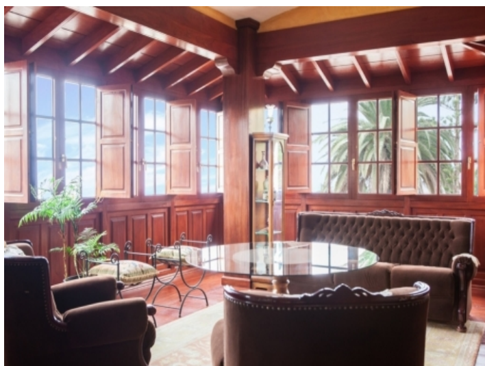
BALCONADA MADERA SALON SOCORRO-CARLOS