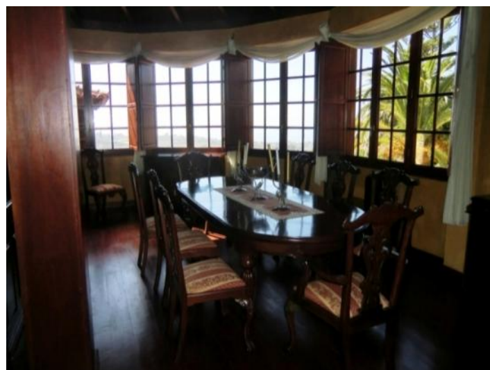
Dining area with beautifully designed windows with wooden frames