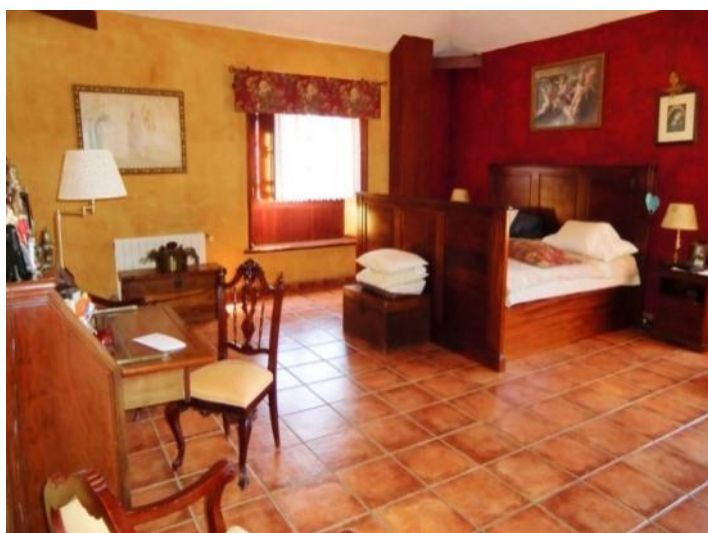
Spacious bedroom with double bed