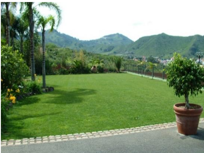
Spacious outdoor area with green space