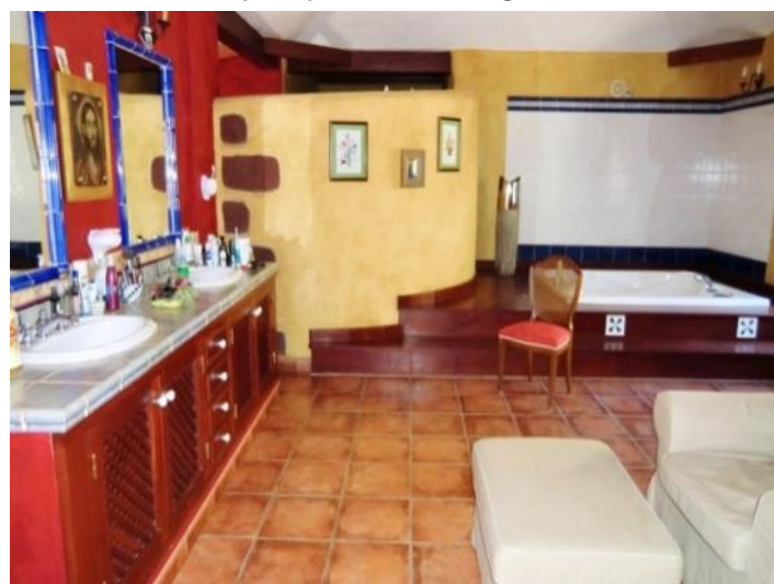
Large bathroom with an impressive Jacuzzi