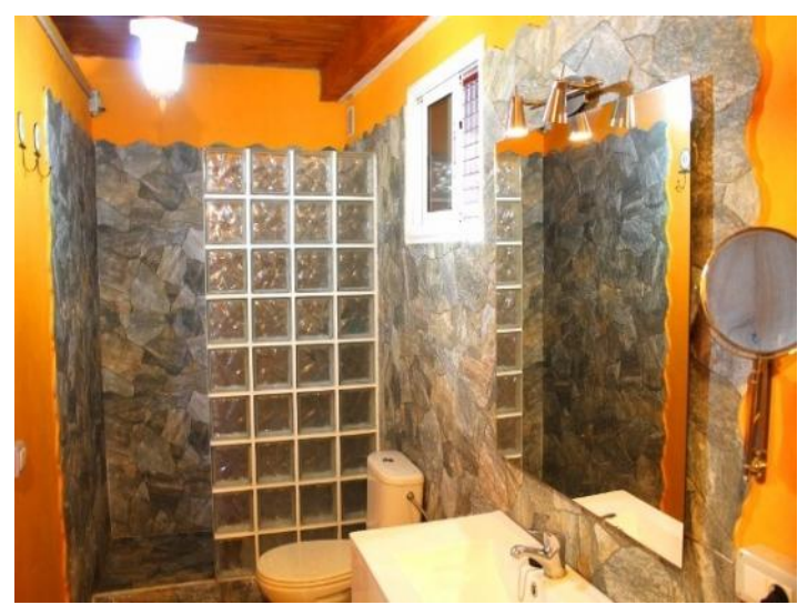
One of the bathrooms