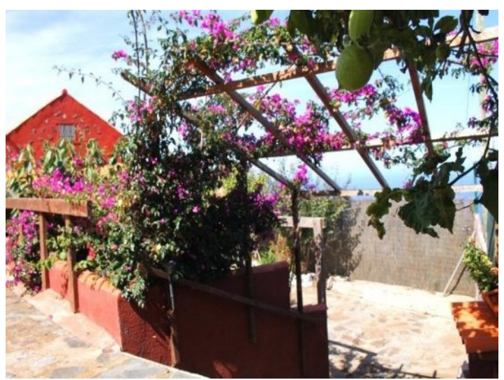
A way to the house