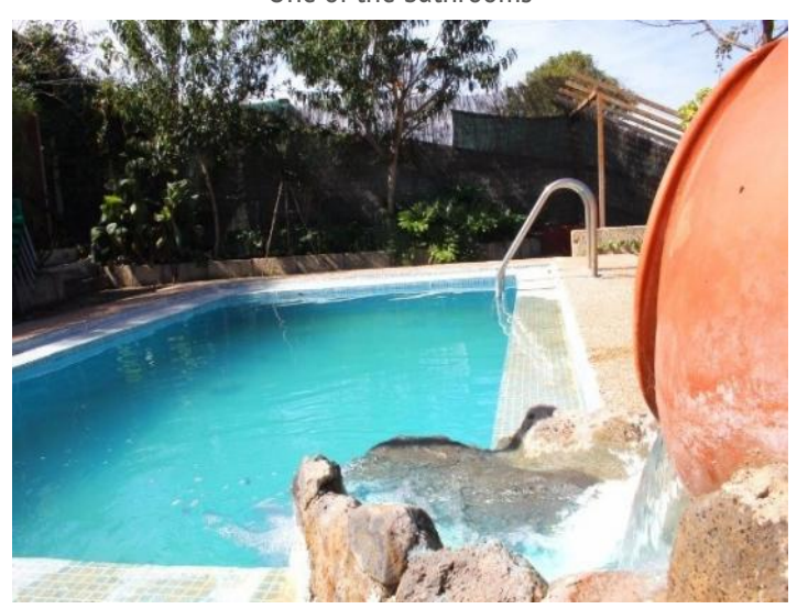
Another photo of the swimming pool