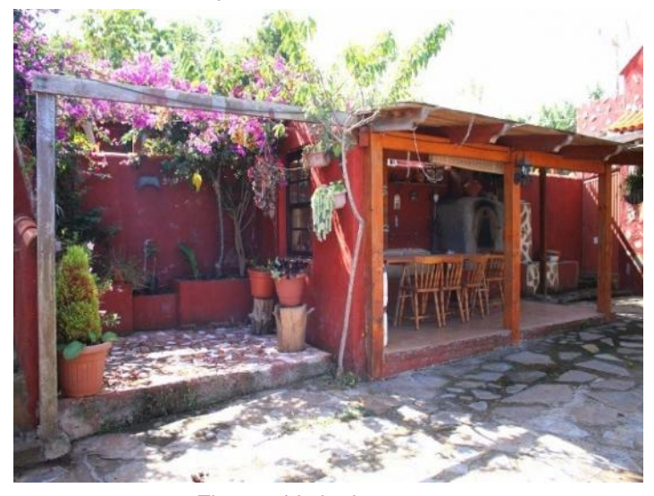
The outside barbecue area