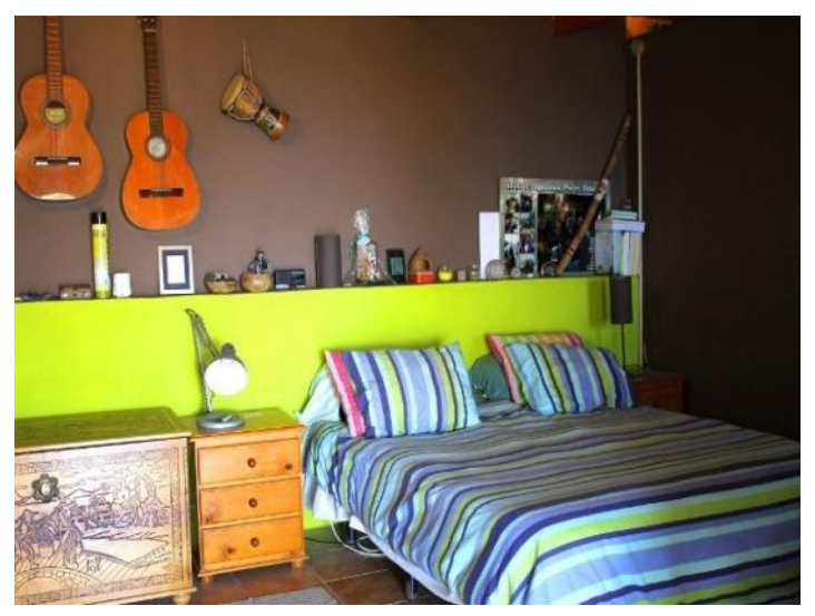
One of the bedrooms