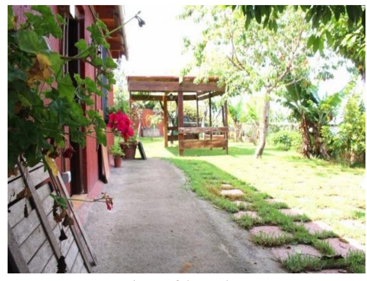
A part of the garden