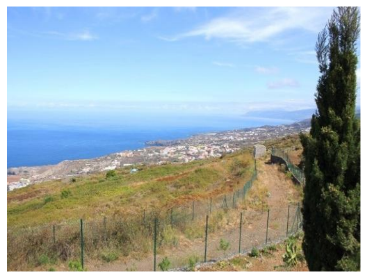
Another photo of the view