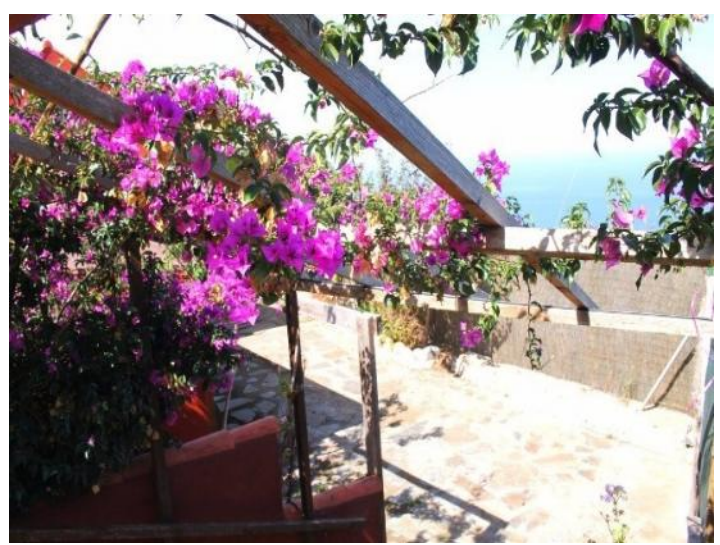
The path between the 2 houses