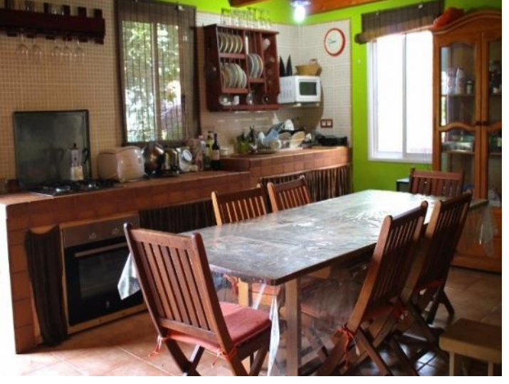
The kitchens in one of the properties