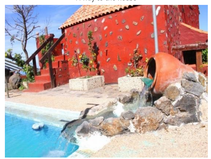
The swimming pool with one of the houses on the background