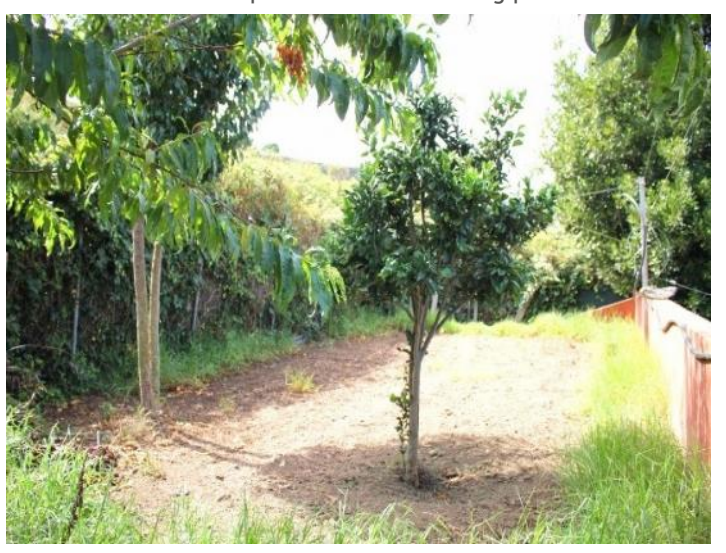
One of the many fruit trees