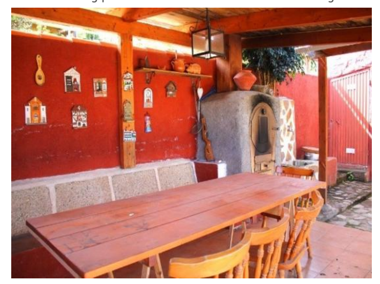
The table and one of the outside ovens