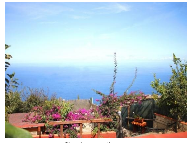
The view over the sea