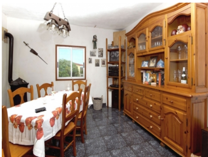
Living area in the main house of the Finca