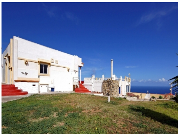
Main and guest house of the Finca