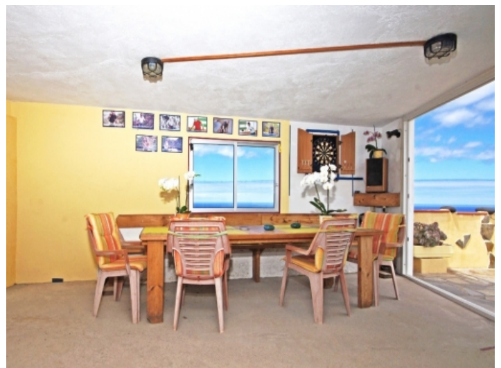
Common room at the Sea View Terrace