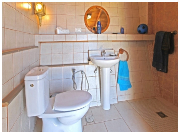
Shower room of the main apartment