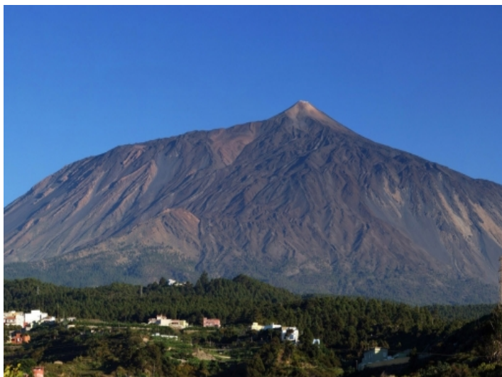
The most impressive perspective provides the Teide just here