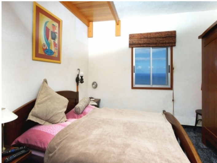
Bedroom in the main house