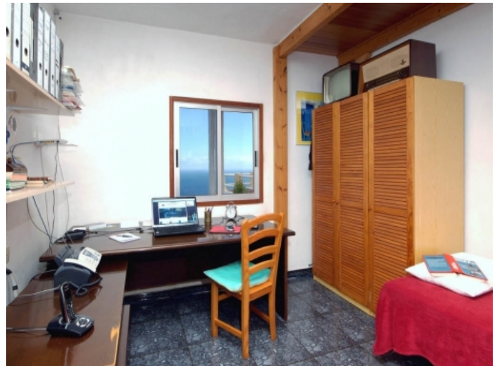
The second bedroom, currently used as an office