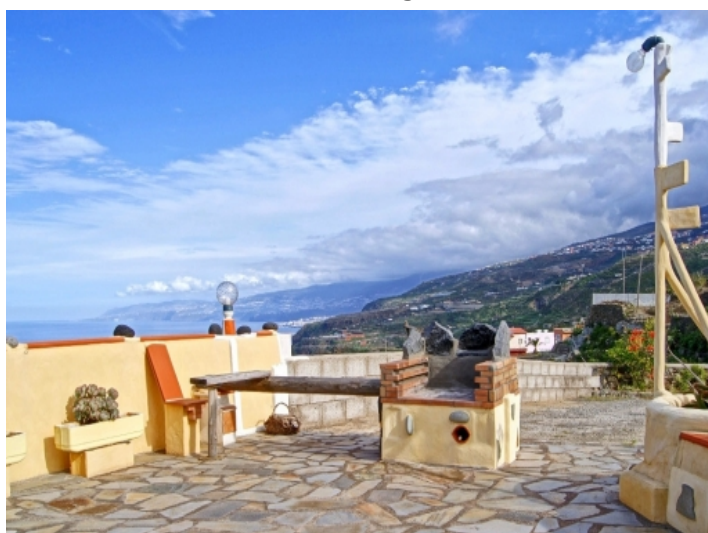
Pleasant facilities on the terrace