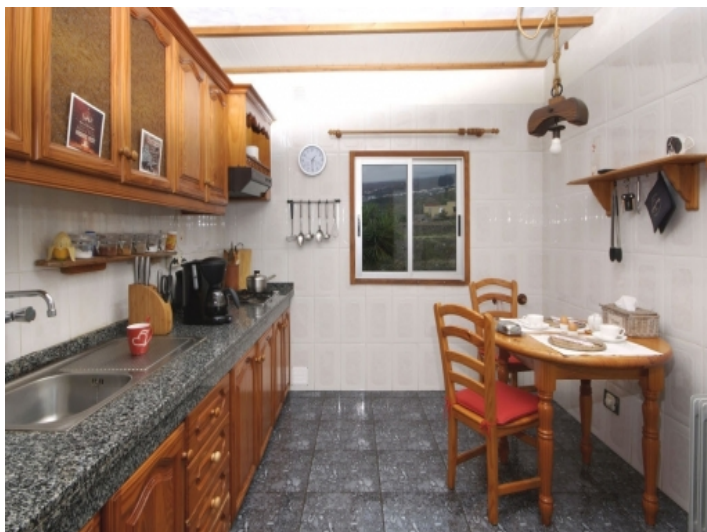
Large kitchen with dining area