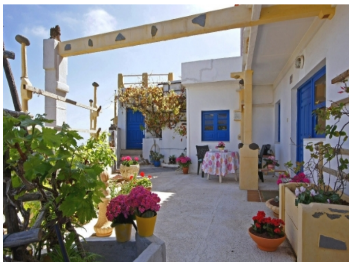
More sea view terraces on the guest area of the Finca