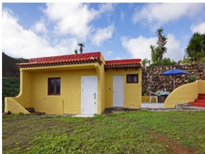
Separate house for guests, storage, office, etc., with practical outside bathroom