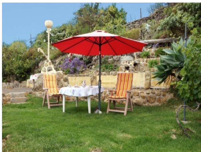
There are many opportunities to relax