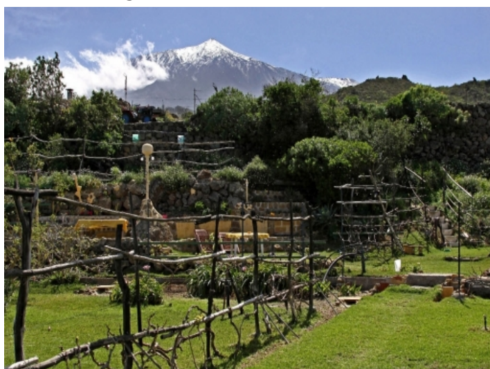
Level acreage, beautiful spots in the garden and the Teide