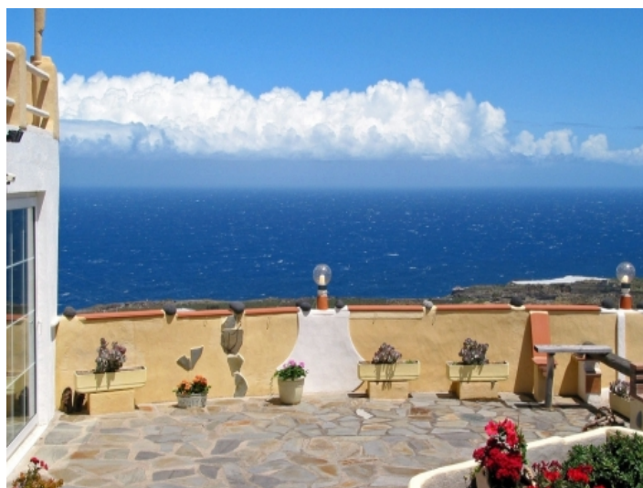
Fantastic views from the terraces