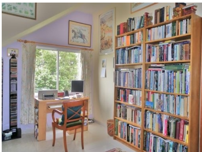
The third residential area between saloon and dining room