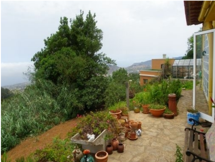
Large garden in front of the panorama terrace