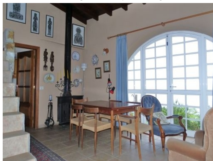
Dining room with beamed ceiling and beautiful iron fireplace