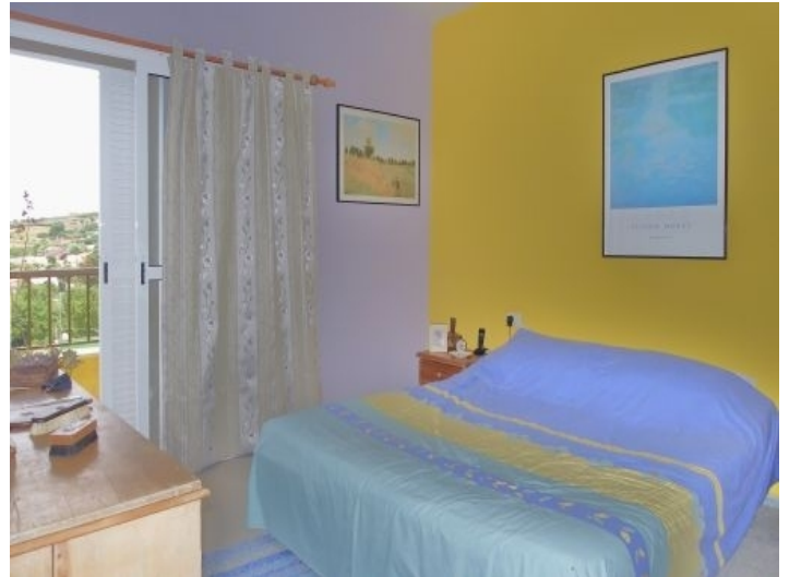
Bedroom with access to the balcony