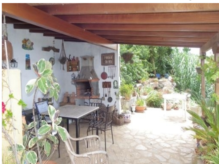
Stylishly equipped covered terrace with barbecue