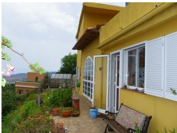
Facade towards the Atlantic and terrace with stunning views