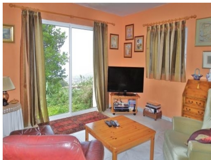
Comfortable living room with panoramic glass doors