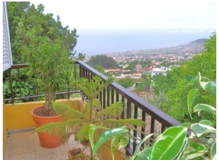
Quiet balcony with fantastic views