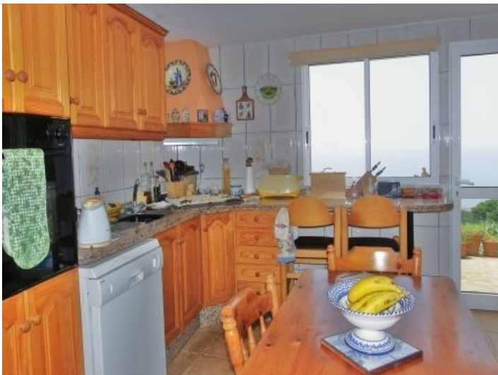
Large kitchen with fireplace and sea view