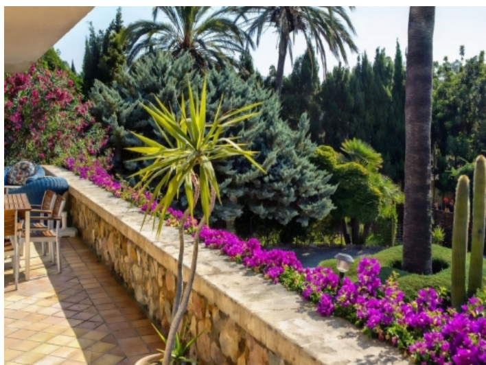
Views from the balcony