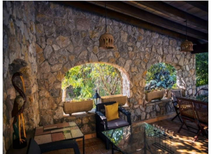
2 separate houses offer further space for guests