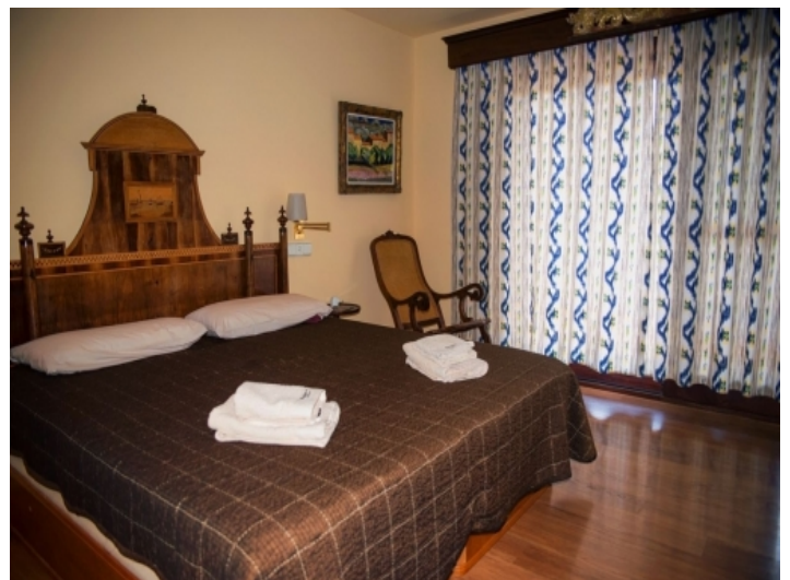
The property offers 6 bedrooms