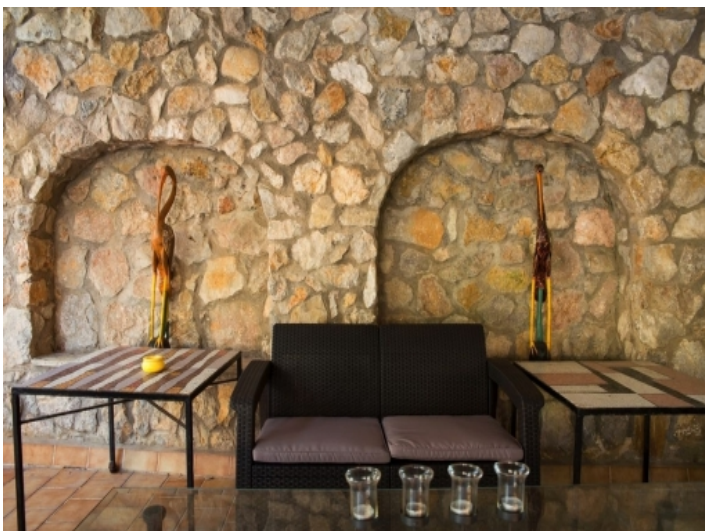
The property offers several lounge areas