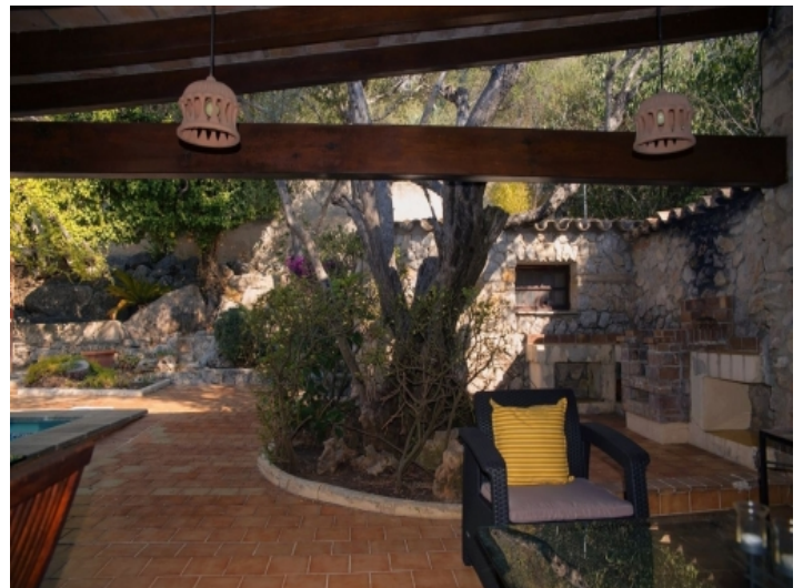
Barbecue area next to the pool