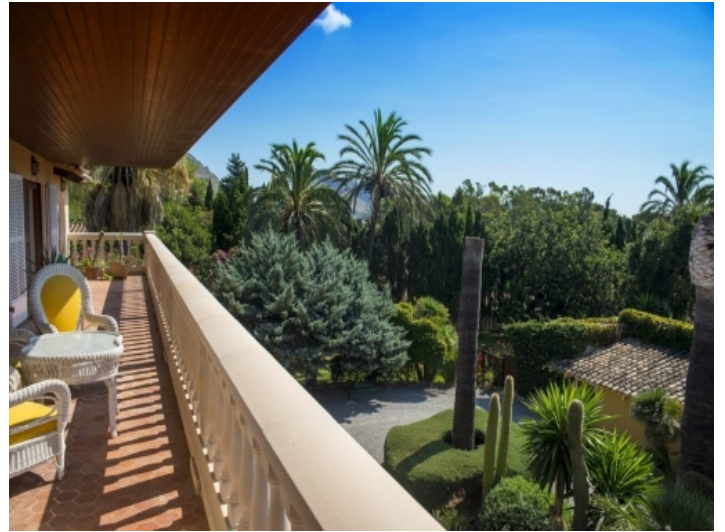
Great views from the balcony