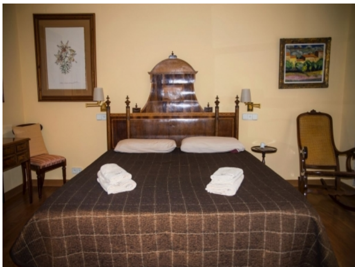
Antique master bedroom