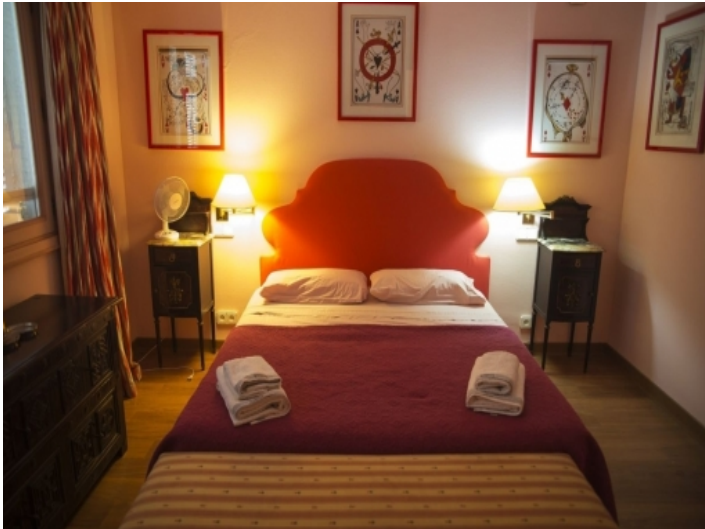
Second master bedroom