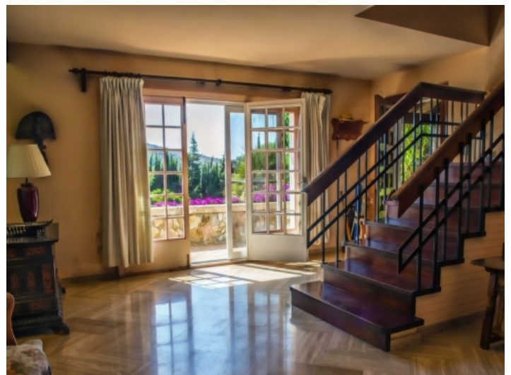
Staircase to the bedrooms