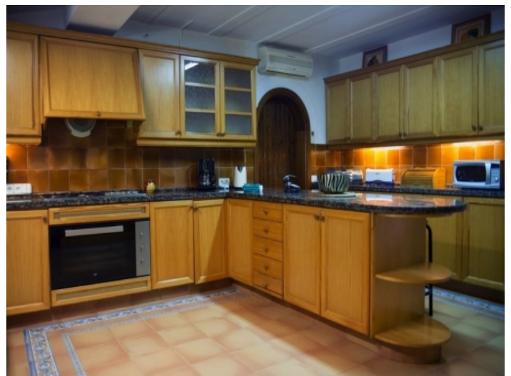
Plenty of storage room in the kitchen