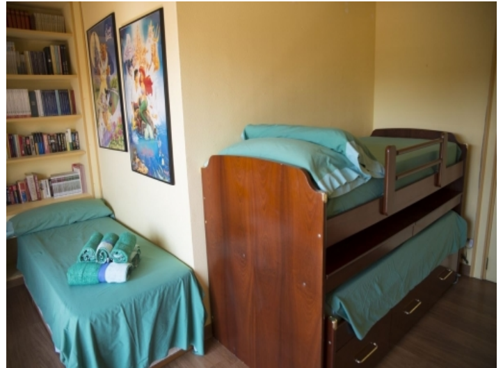
Guest bedroom with functional bunk bed