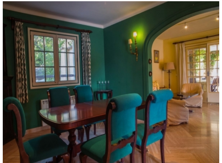
Alternative views of the dining area