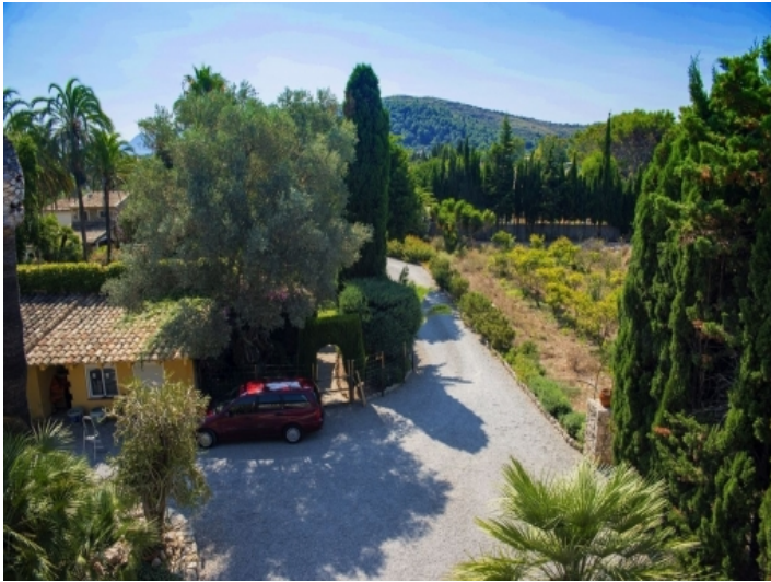
Long driveway to the property