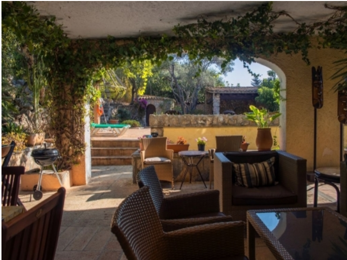
Covered chill-out area