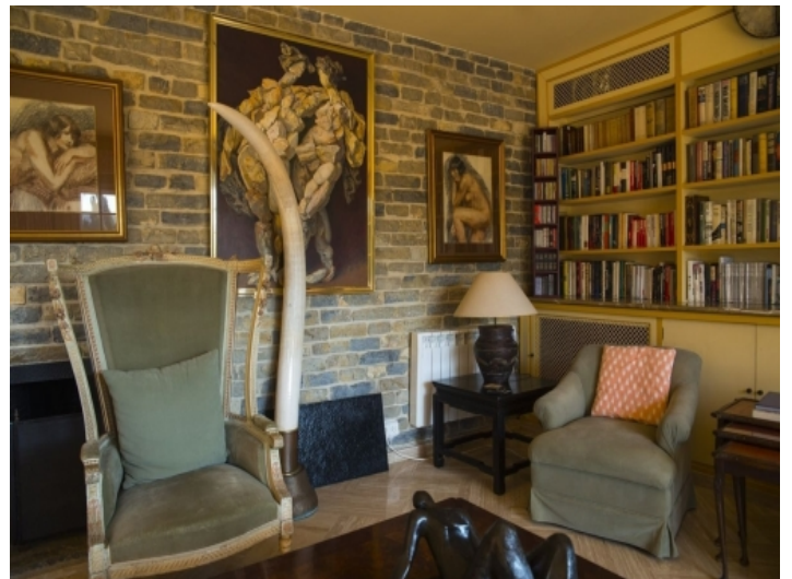
A nature stonewall decorates the living area