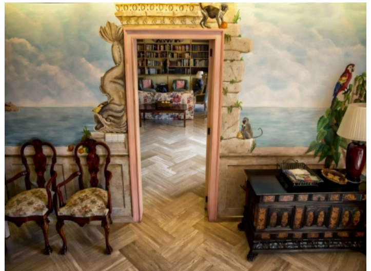
Extravagant interior design