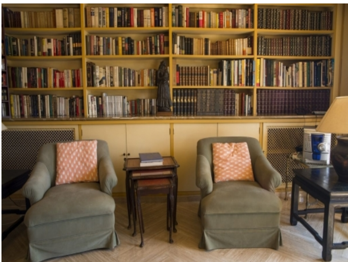
Small library with arm chairs