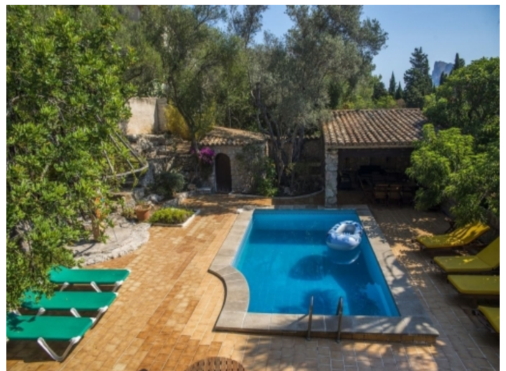
Inviting sunloungers in the pool area