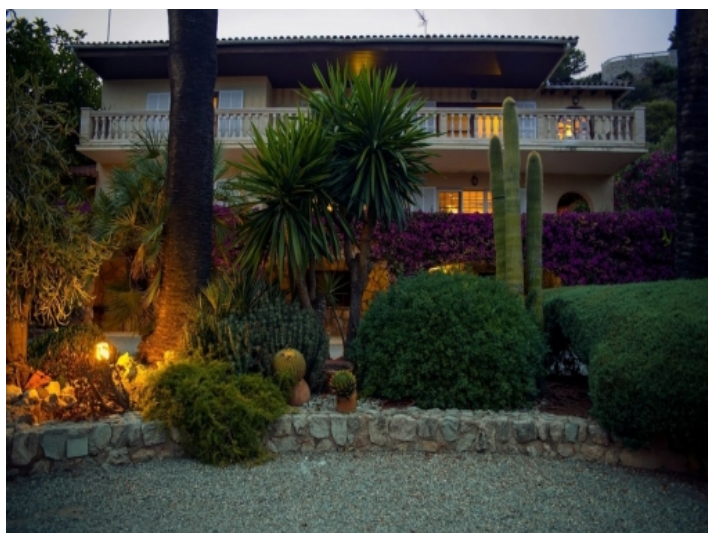
Exterior views of the finca