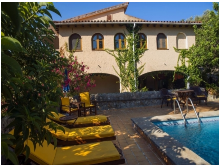
Main pool area of the finca