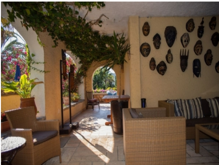
The property is surrounded by nature