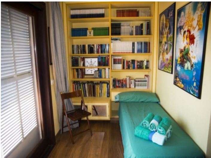
Alternative views of the guest room