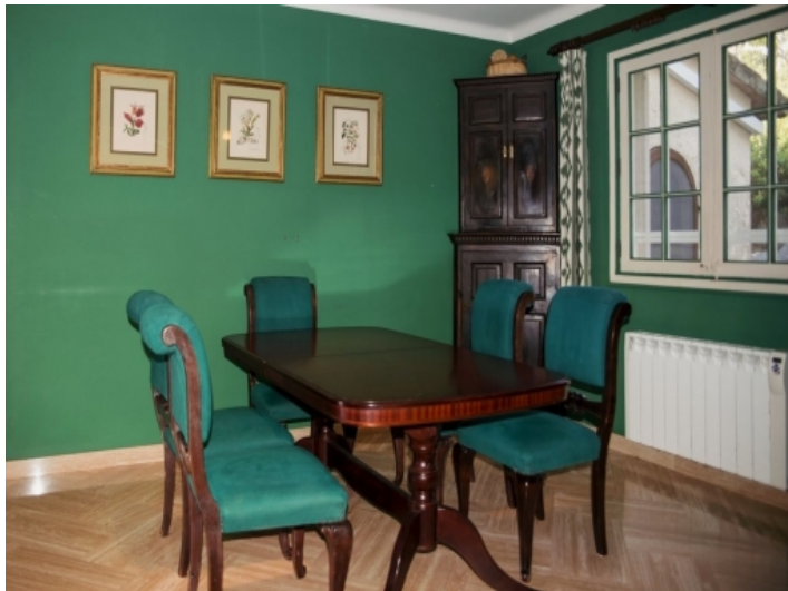
Dining area in green