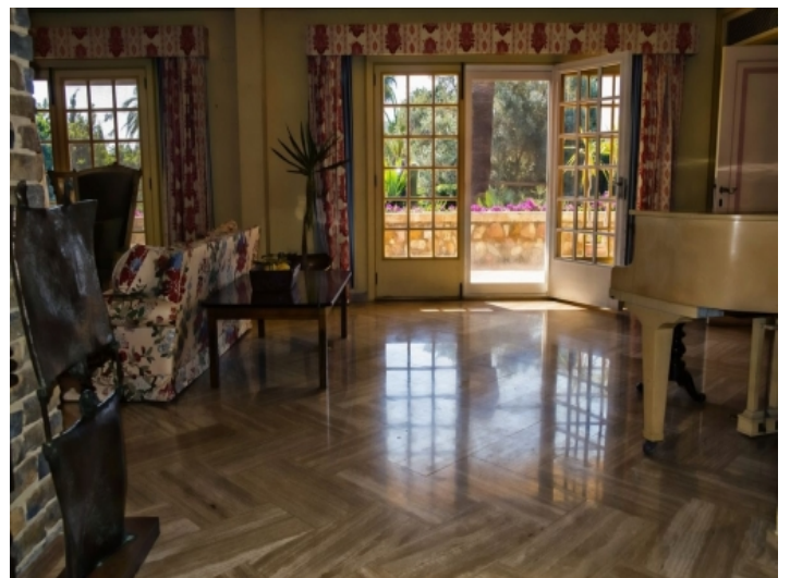
Access to the terrace