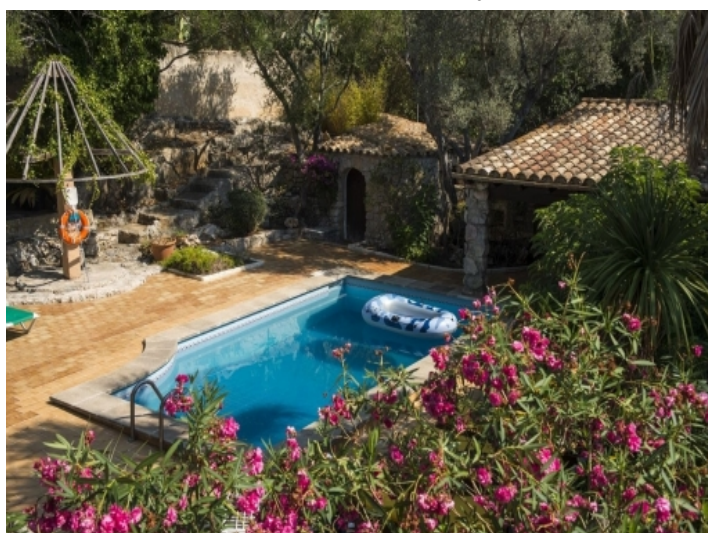
Views of the pool house and pool area