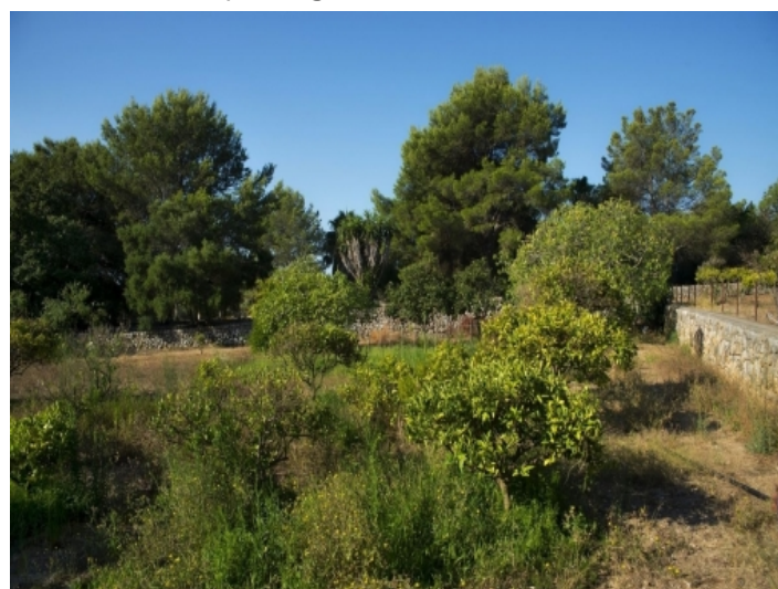
Garden area of the property