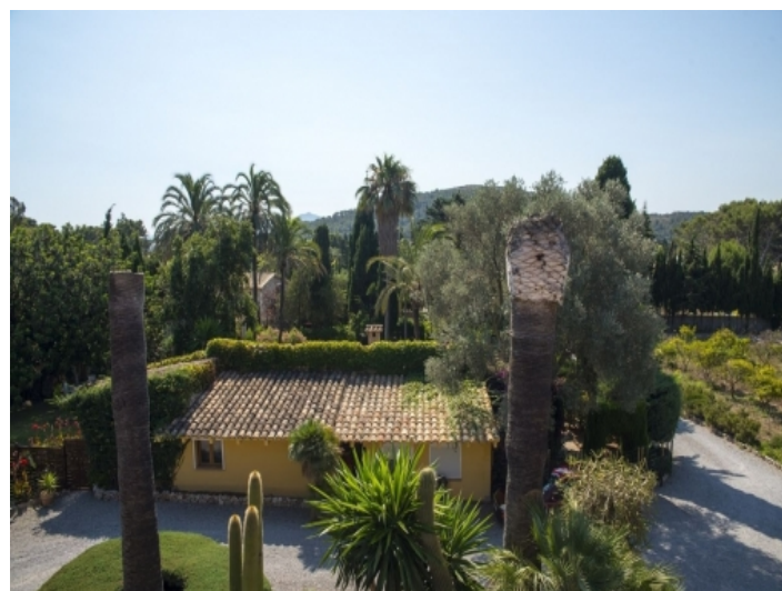
Separate guest house of the finca