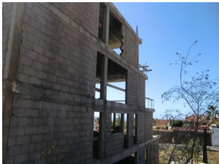
Views to the sea