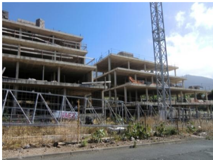
View of the right building