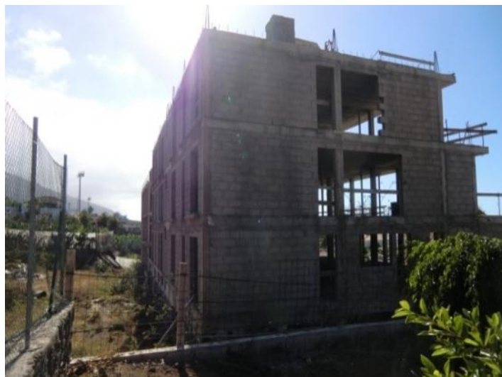
View from the side