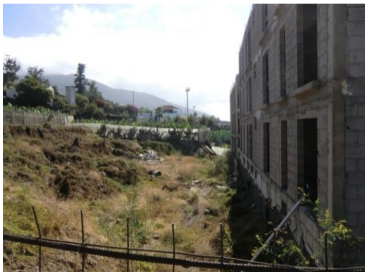
Rear portion of the property