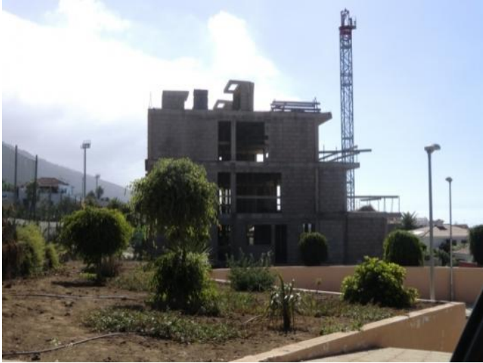
Other side view