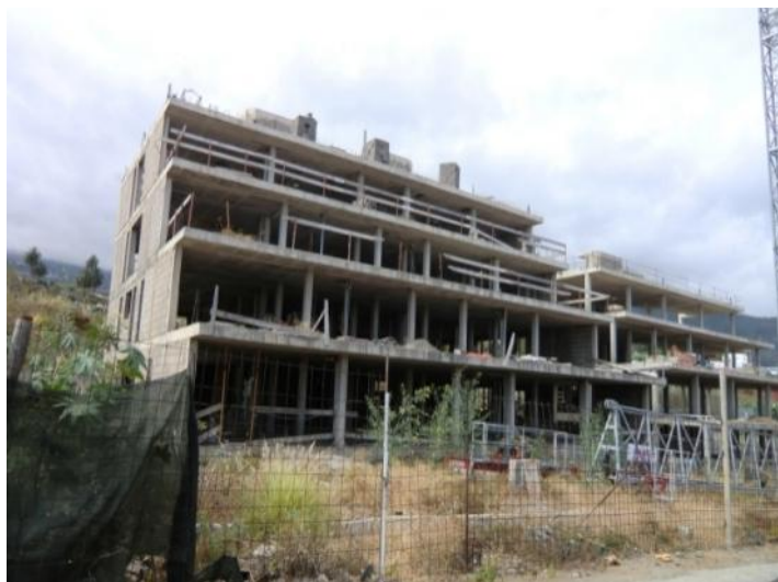
Plot with two buildings