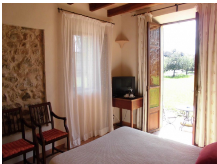
One of the 5 bedrooms