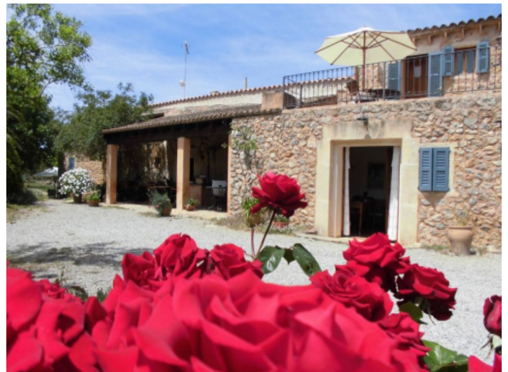
Well maintained lovely garden