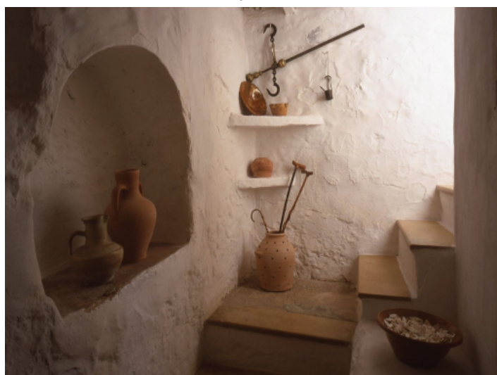
Stairs to the suite