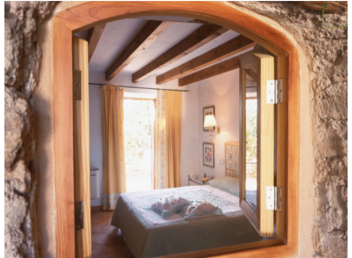
One of the 5 bedrooms