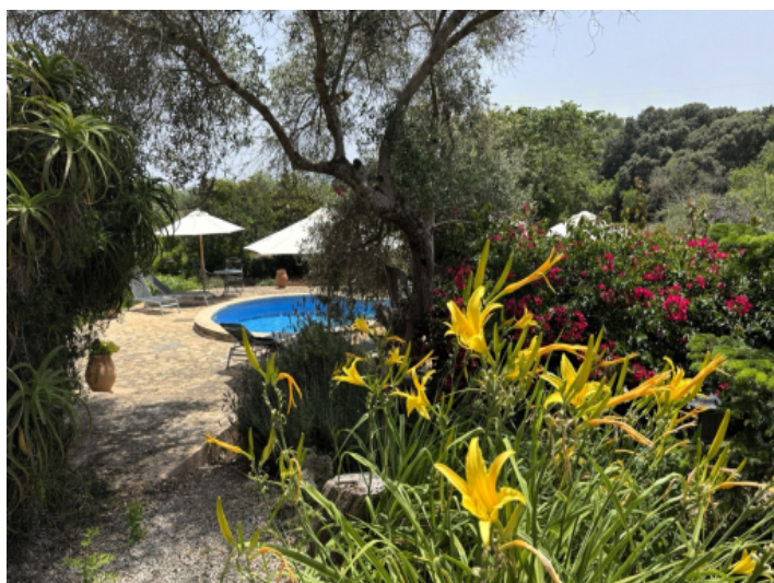
Views to the pool area