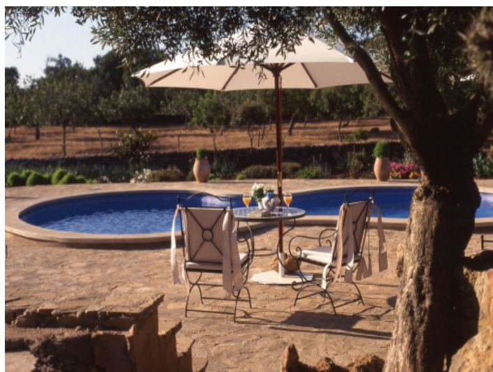
Views to the pool area