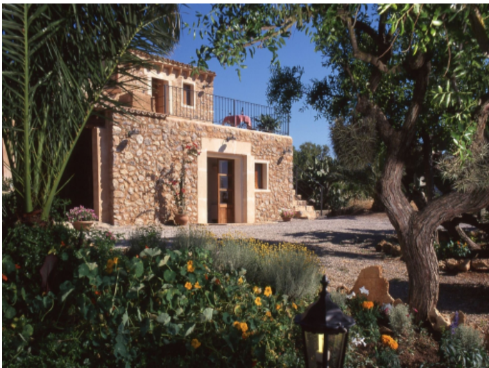
View to the hotel