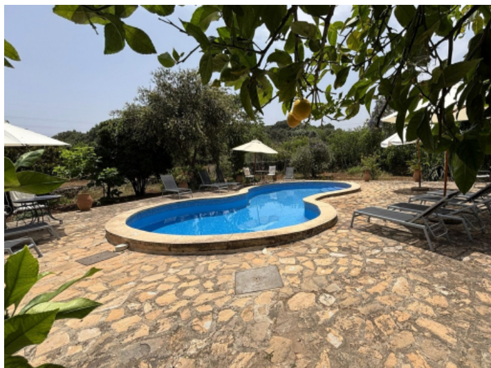
Views to the pool area