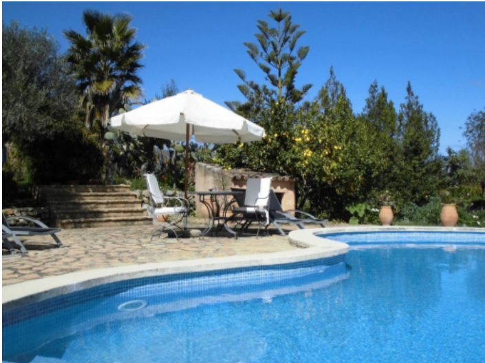
Pool area and its sun terraces