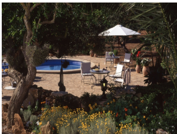
Views to the pool area