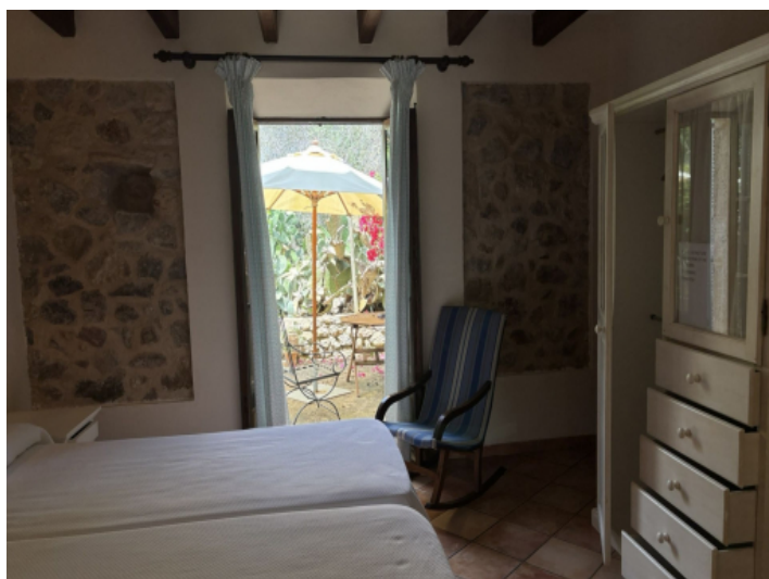
One of the 5 bedrooms