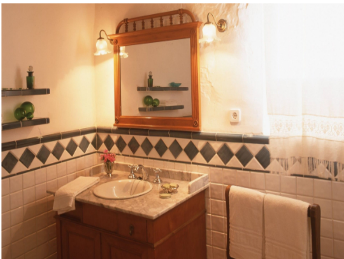
One of the 5 bathrooms