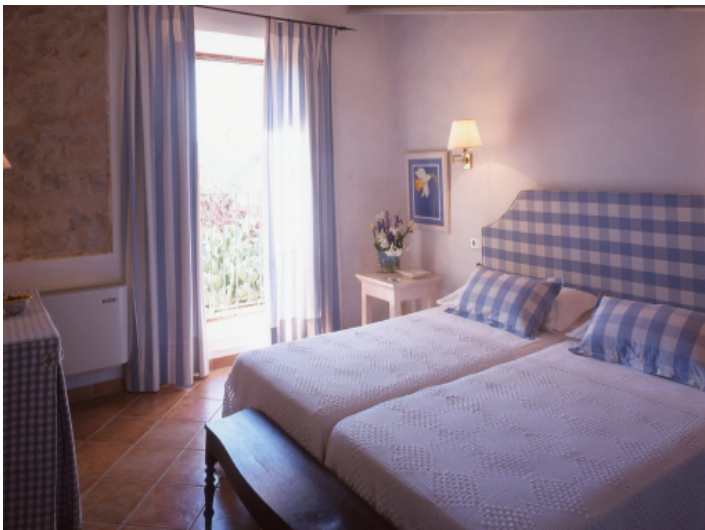
One of the 5 bedrooms