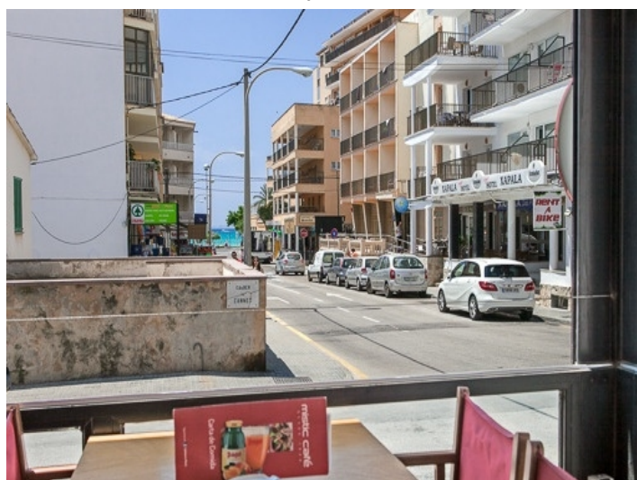
Views from the terrace to the street