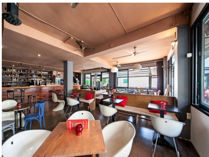
Elegant dining area