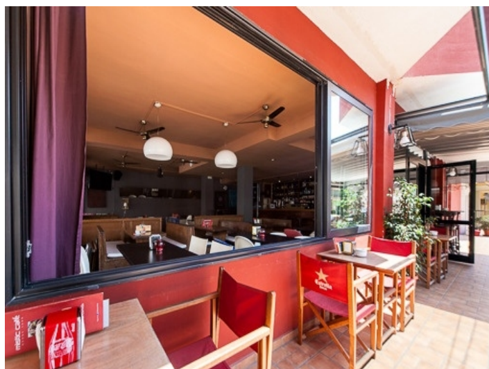
Views from the terrace to the inside area