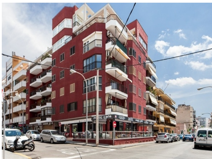
Views to the front from the street