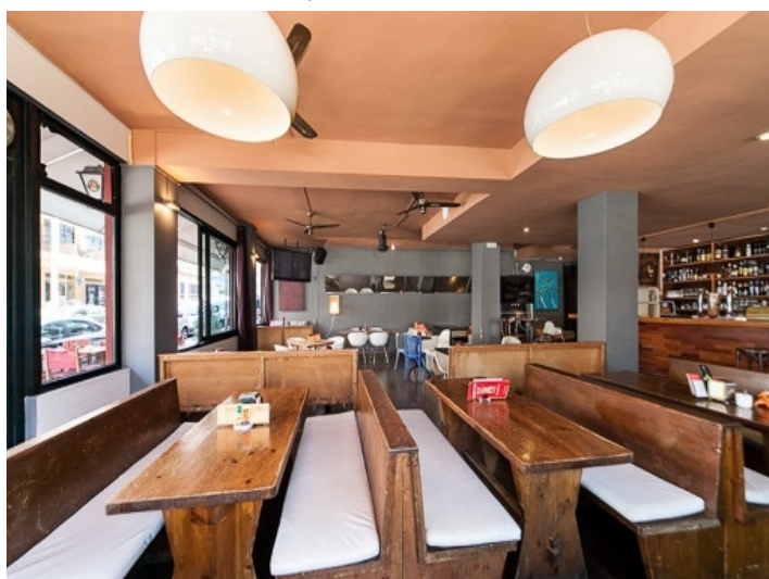
Light flooded restaurant