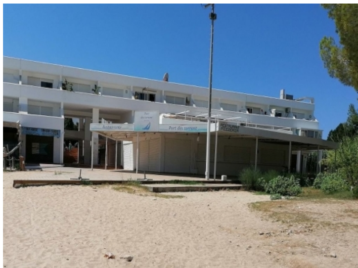
Exterior view of the restaurant