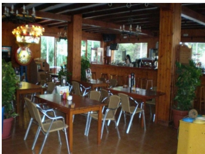
Interior dining area