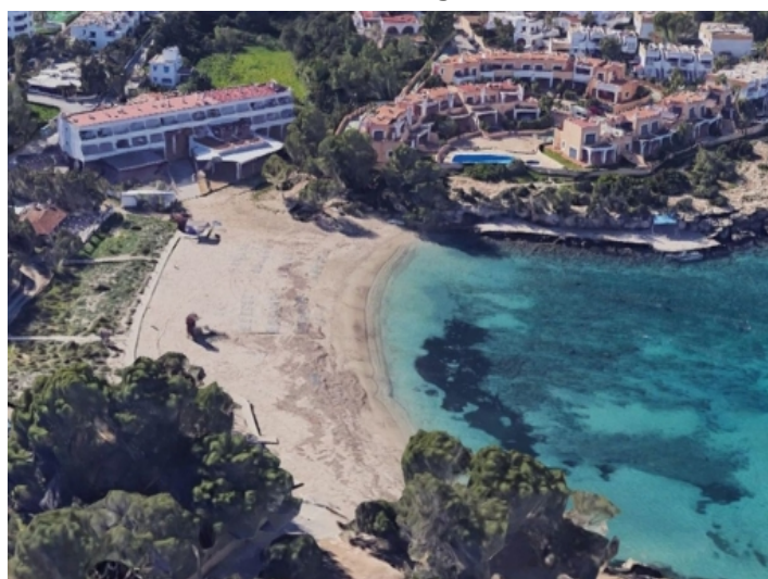
View of the beach