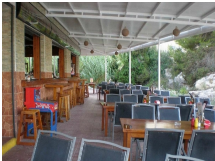
Covered dining area