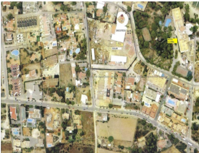
Plot for a club on Ibiza