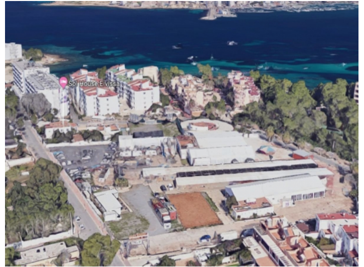
Plot for a club on Ibiza