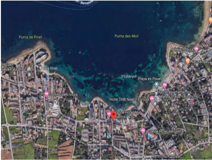
Plot for a club on Ibiza