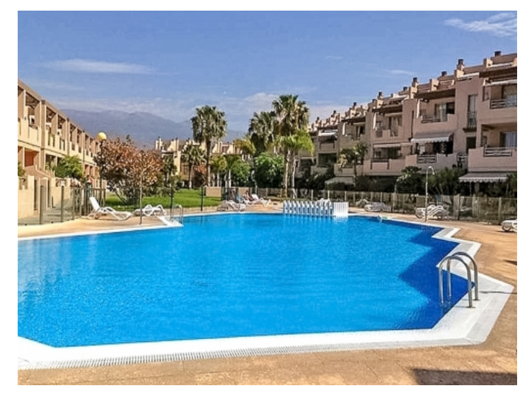
Large communal pool