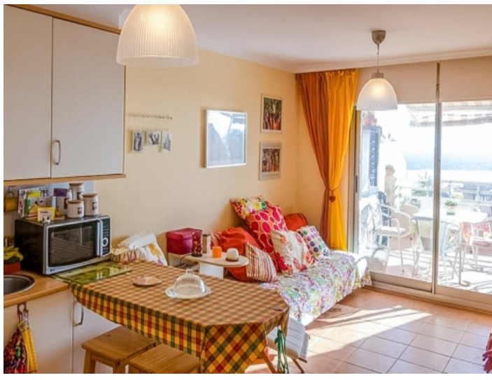
Bright living area with terrace access