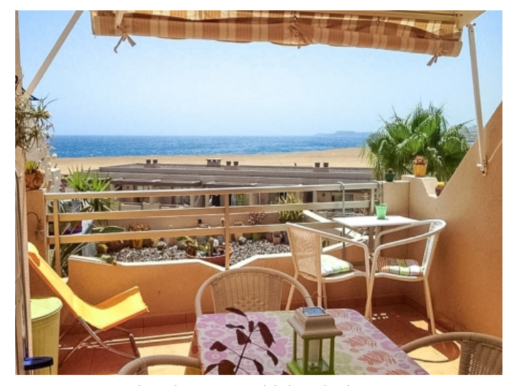
Lovely terrace with beach views