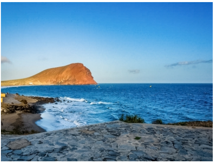
The apartment is situated in first sea line