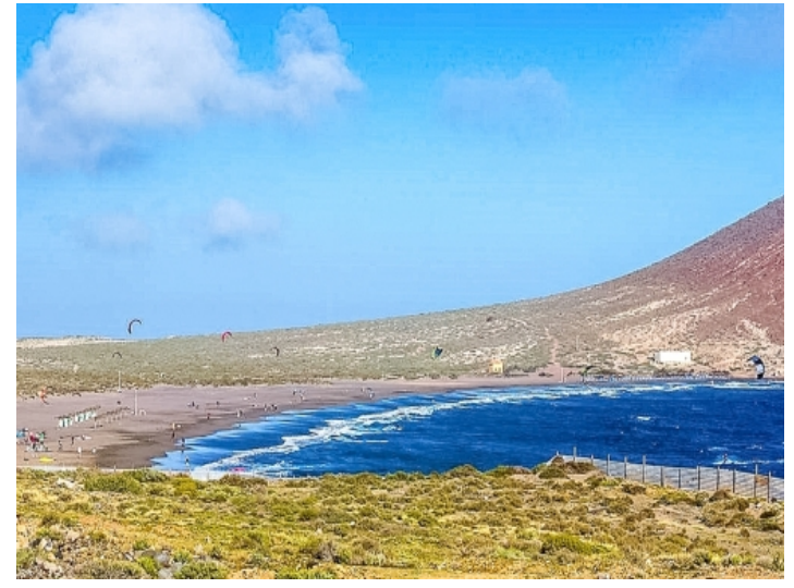
The beautiful beach La Tejita