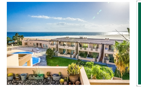
La Tejita search for property TEN-406026