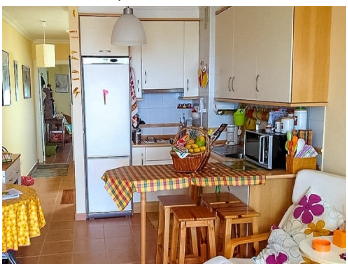
Views to the open kitchen