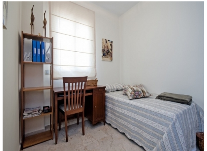
Cozy third bedroom