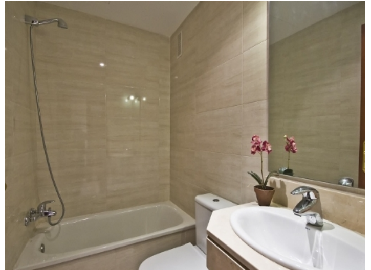
Bright bathroom with bathtub