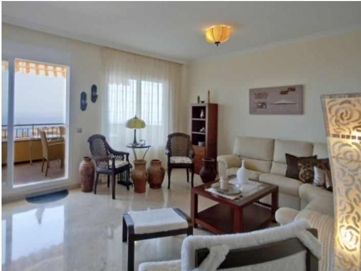
Spacious living room with access to the terrace