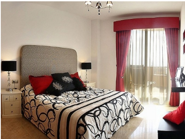
Master bedroom with sea views