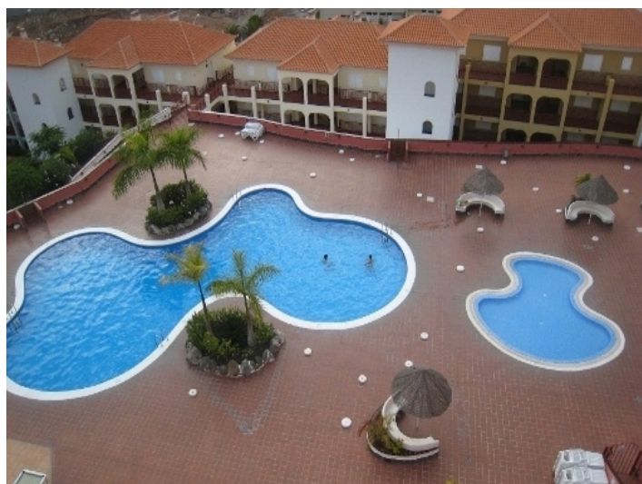
The community pools