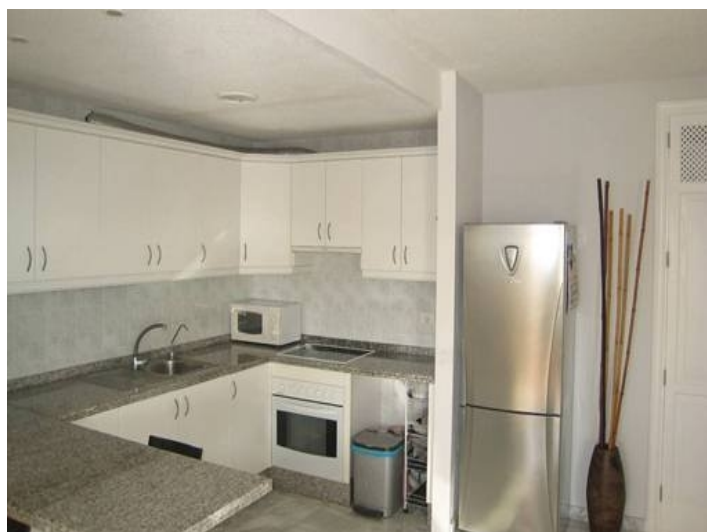
The bright, fully equipped kitchen