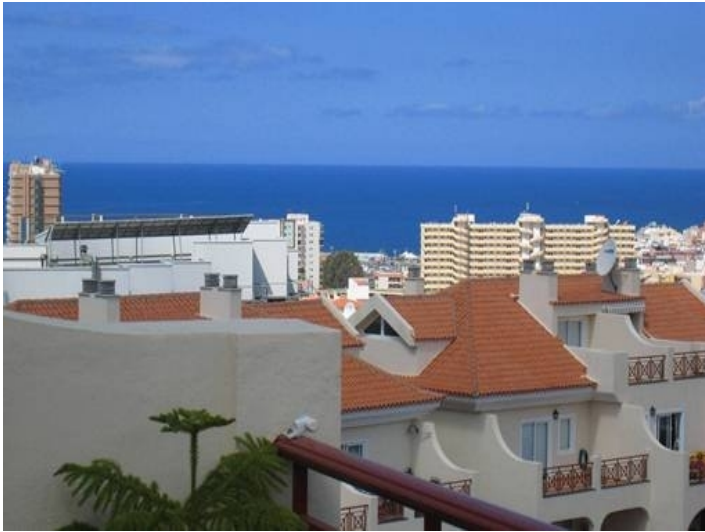
The view from the terrace