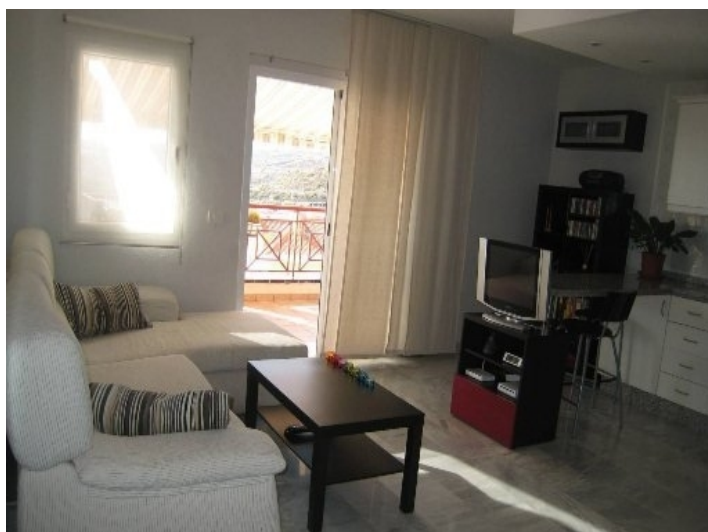
The spacious living room with access to the terrace