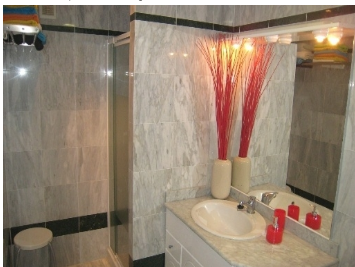
The modern bathroom