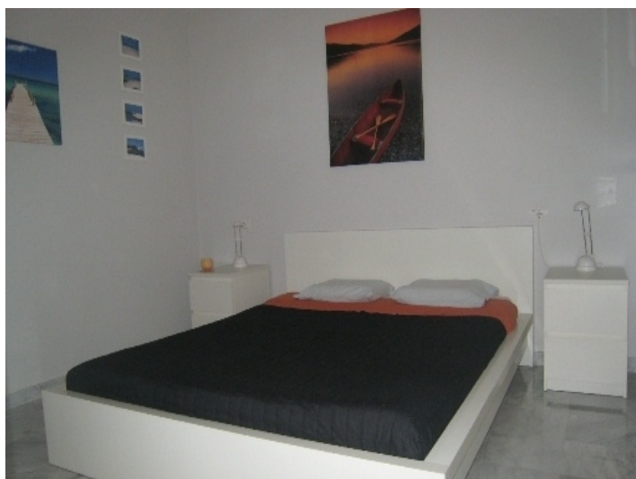
The double bedroom