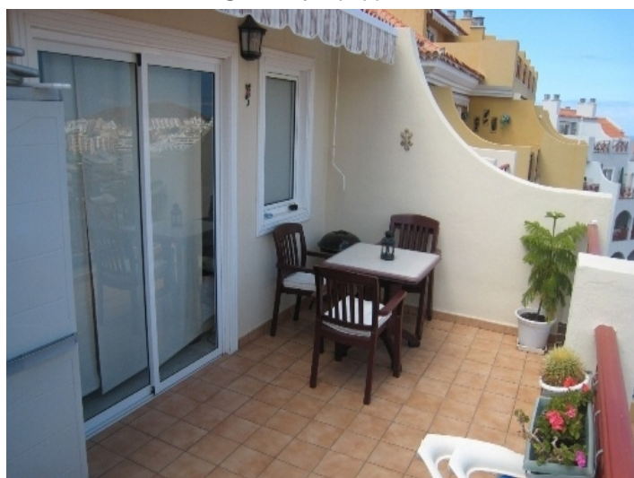
The beautiful terrace with great sea views