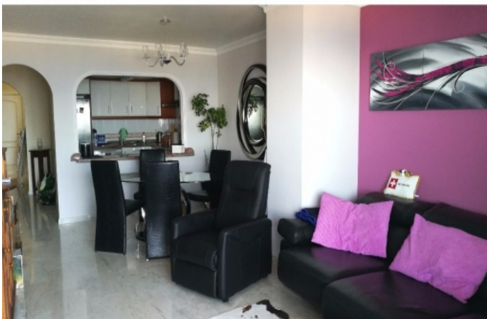
Bright Living Room