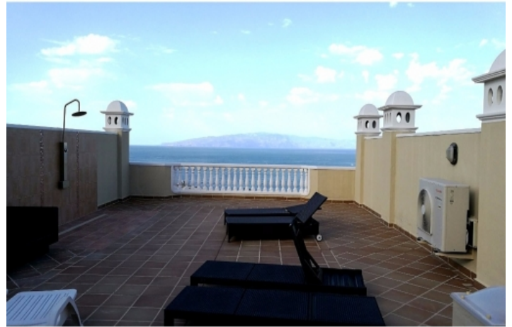
Huge Terrace on the roof