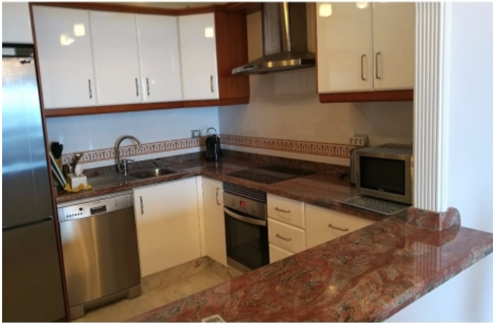
High End Kitchen