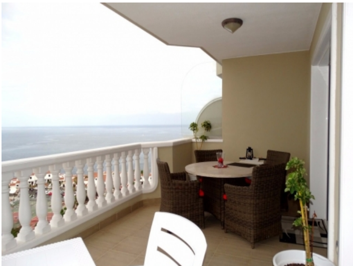
Another Terrace / Balcony