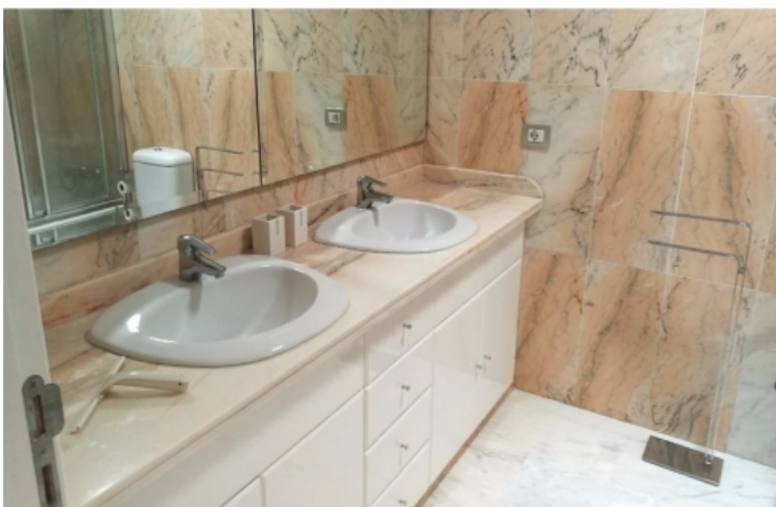
Bathroom with marble floors