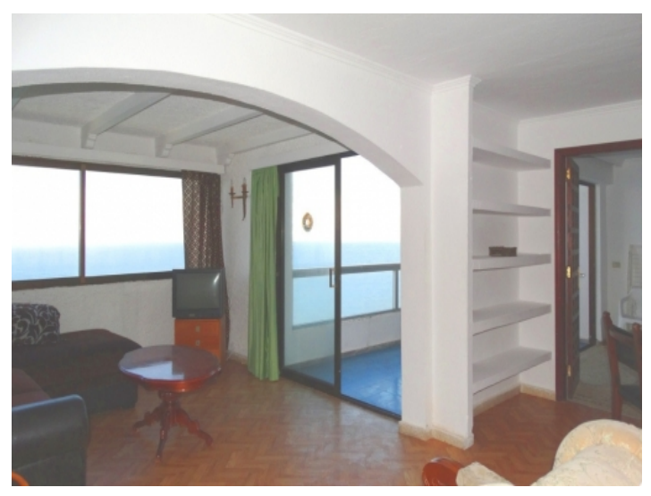
The spacious terrace communicating with the living room and