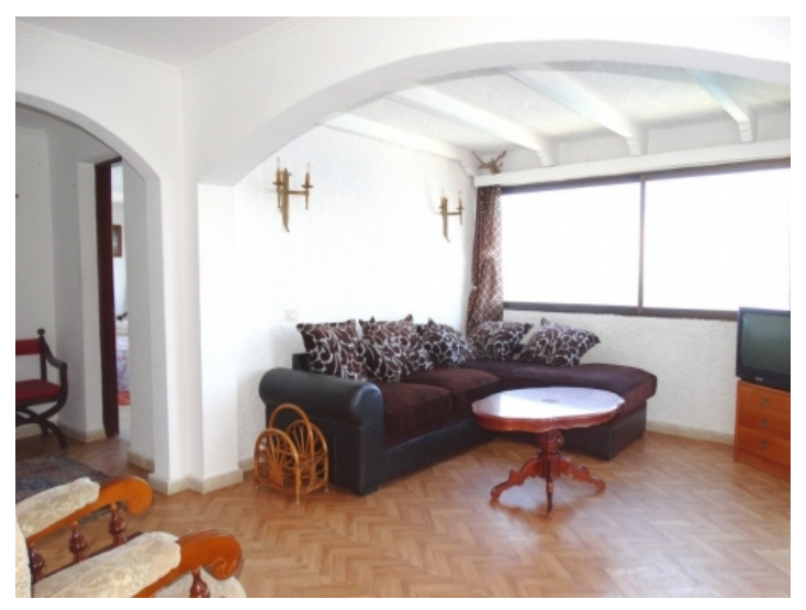
Large living room of the well-structured apartment