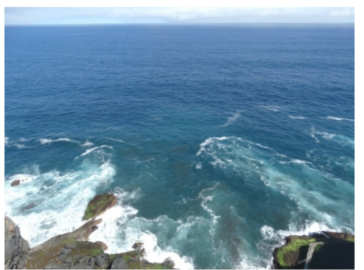
Sea view as it would be from the deck of a cruise ship