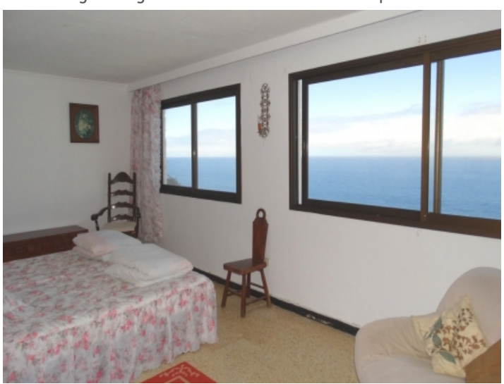
Plenty of space in the master bedroom