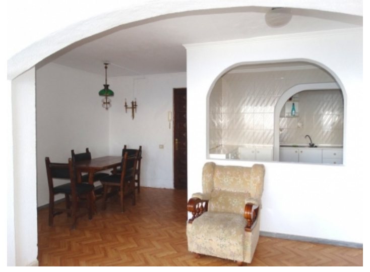
Kitchen and dining area in the apartment