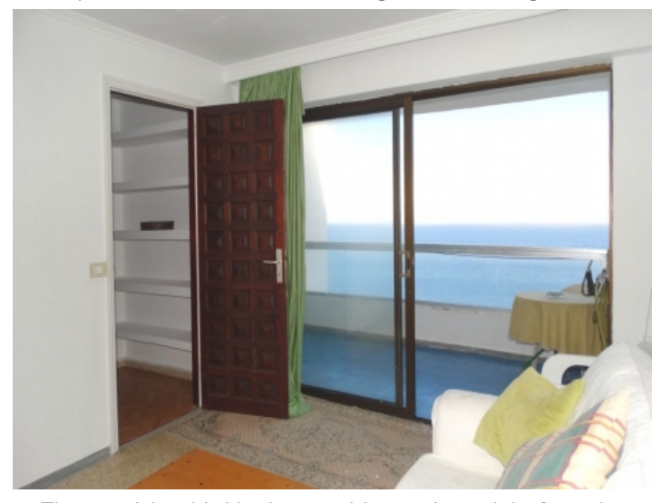
The exquisite third bedroom with sea views right from the