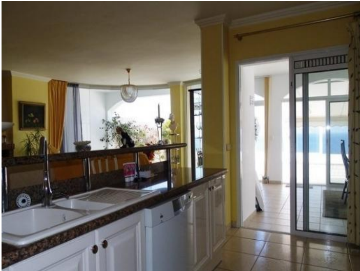
Much light, in the integrated kitchen of the living-room area