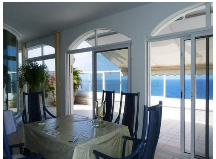
Dining-room and transition to the terrace with awning