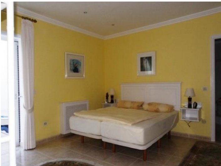
Master bedroom with access to the pool and Ensuite bad