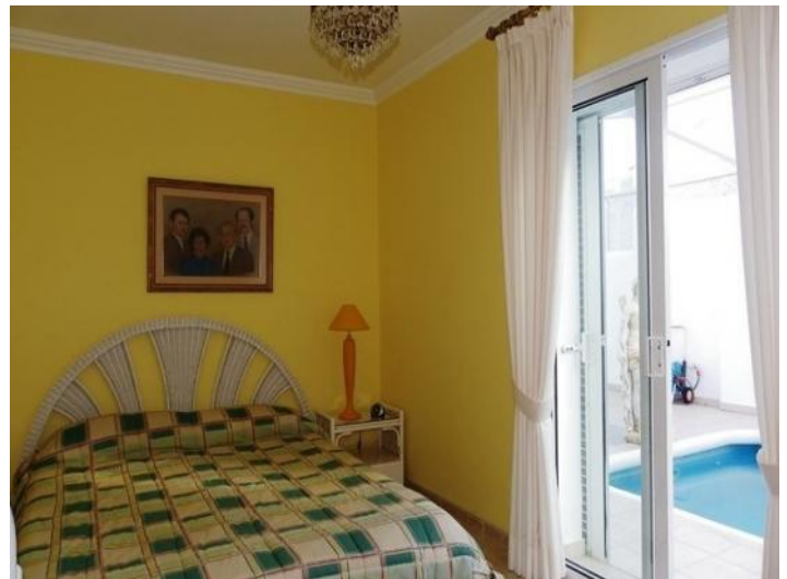
The second bedroom at the swimming pool