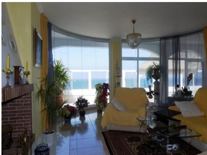
Exquisite Salon in round shapes