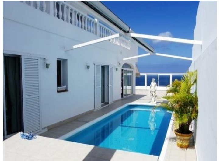
The sheltered swimming pool in the bedrooms