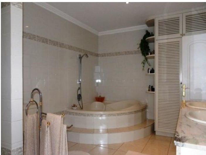
Plenty of room in the bath with round tub