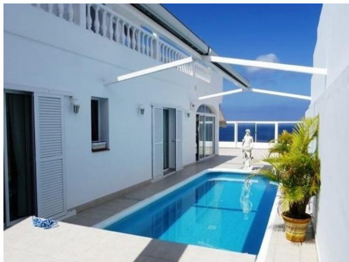
The sheltered swimming pool in the bedrooms