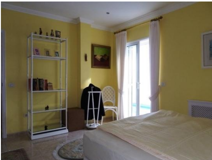
Another perspective of the bedroom