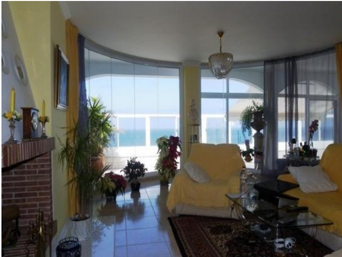
Exquisite Salon in round shapes