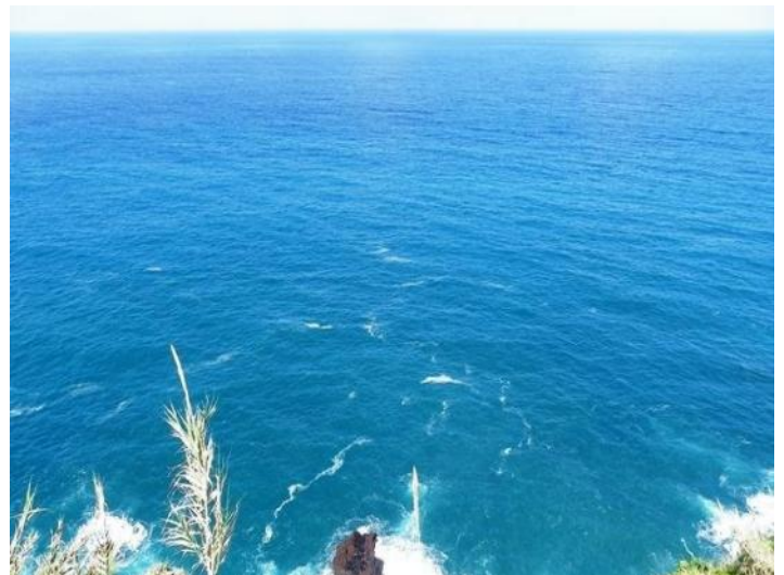
The premium view from the terrace