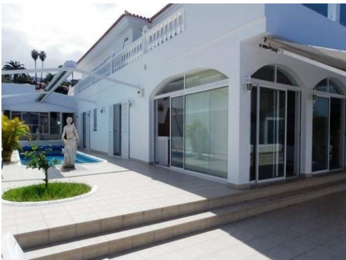
Design of the terrace corner