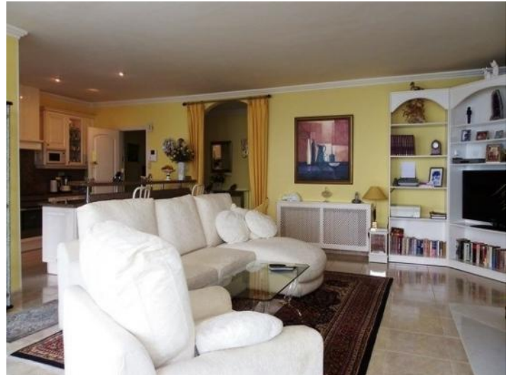
Plenty of light and warm colors