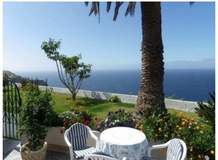
Wanderlust feeling with great Canarian palm