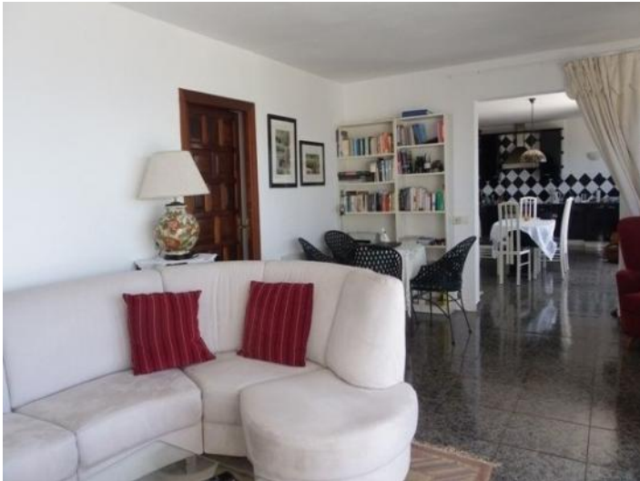
Spacious living area with panoramic sea views from the first