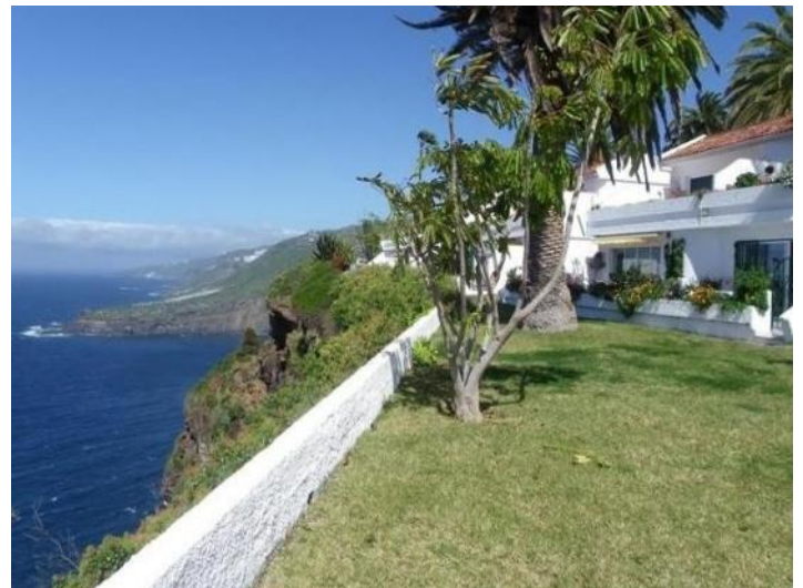
The well-kept garden right on the cliff