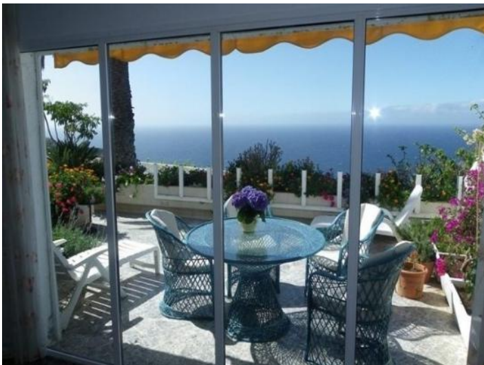
Terrace of 75 sqm subdividd in two areas