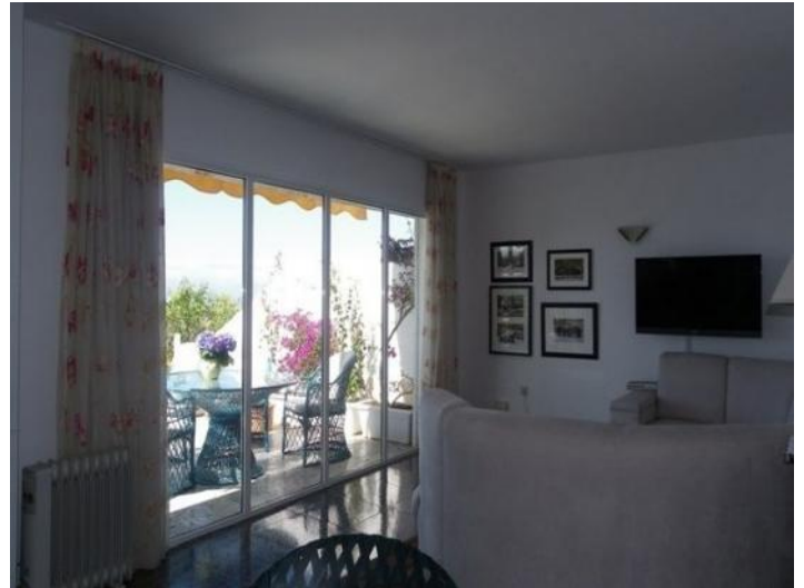
Bright living room with large sectional sofa in the front row