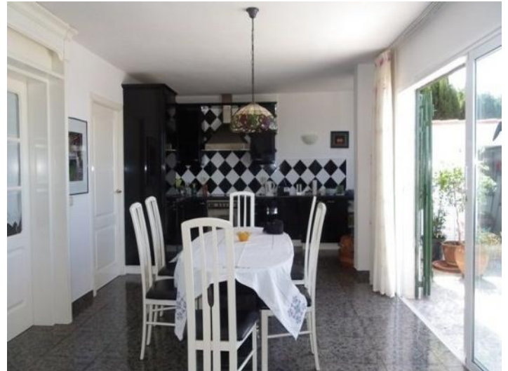
Separate dining area with stylish kitchen