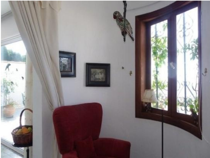
Cozy bay window at the salon