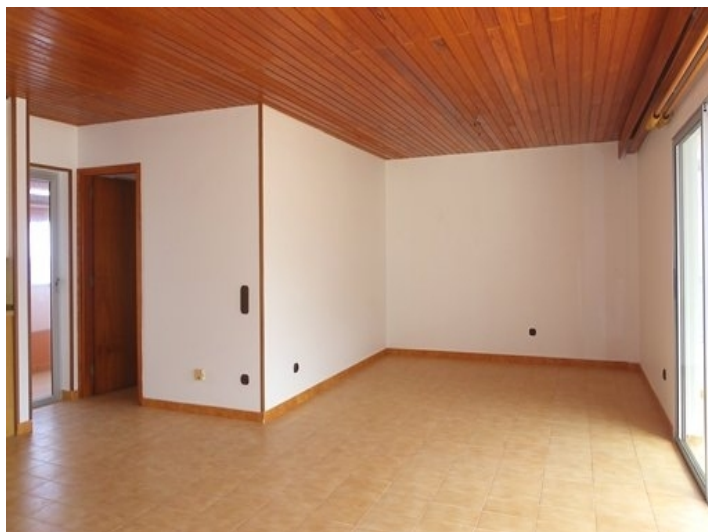
Spacious living room and the room at the West Terrace