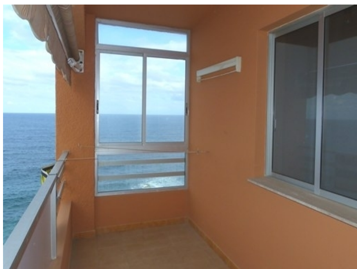
The Sunset Balcony