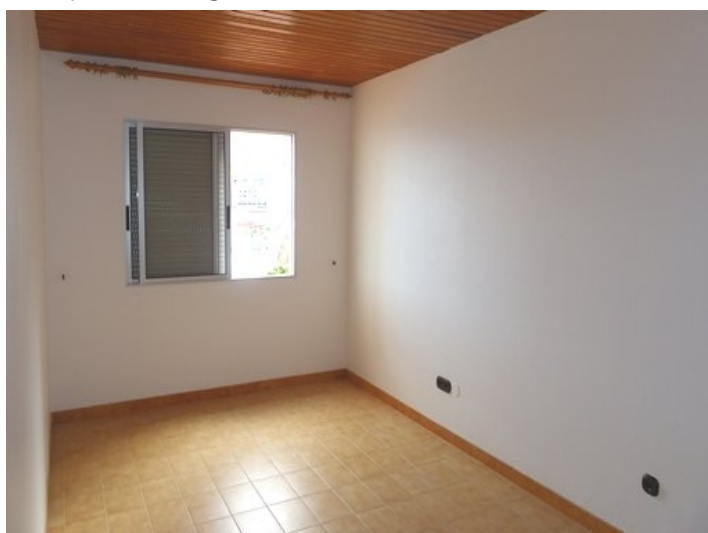
Bedroom for morning sun