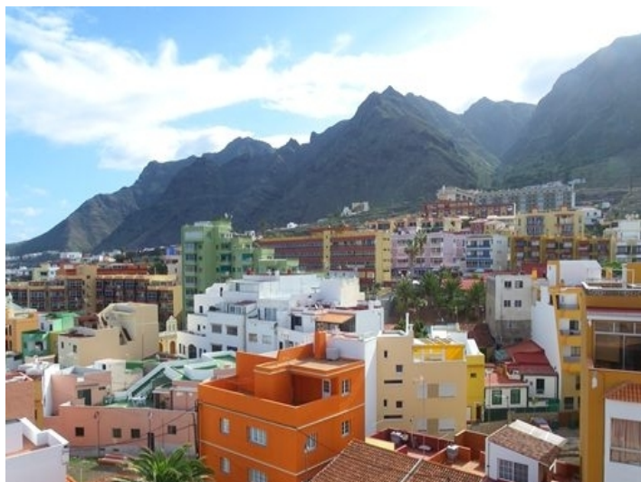
View of the Anaga mountains