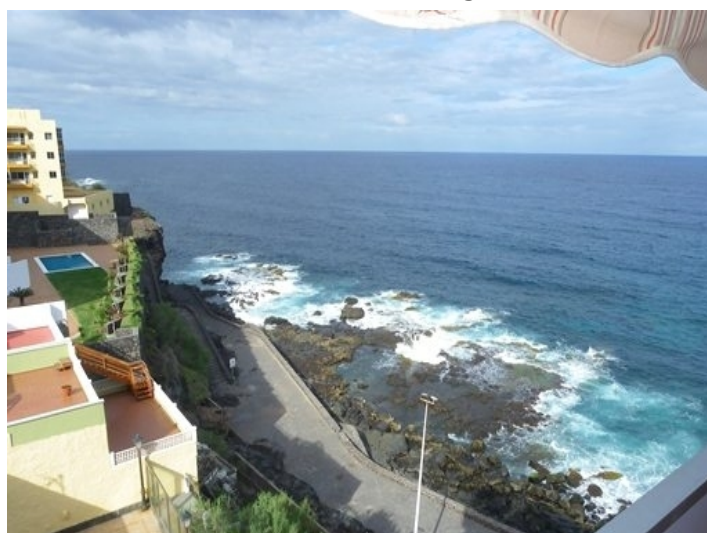
Overlooking the promenade and the waves