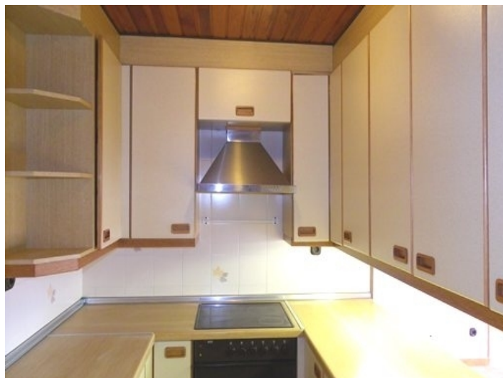
Kitchen with stove and range hood