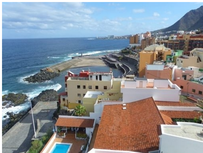
View over the small port to Punta del Hidalgo