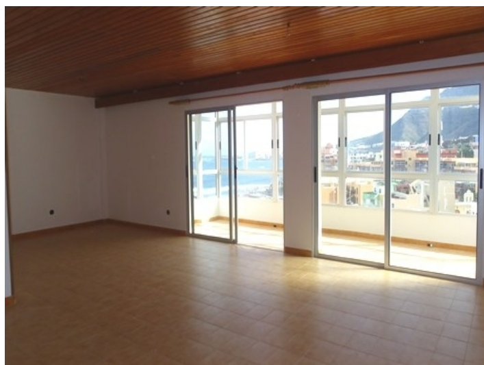
The sheltered terrace outside the living room