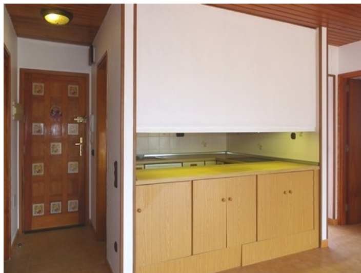
Entrance with bathroom and kitchen