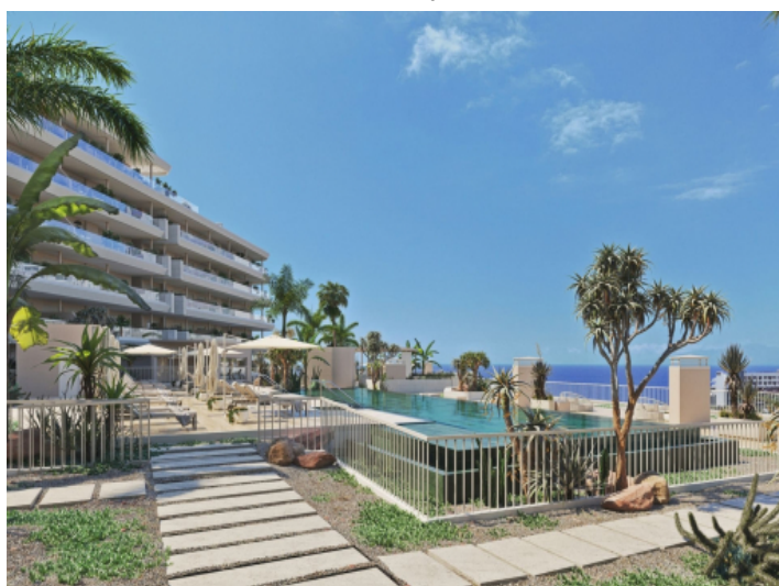
Pool and garden