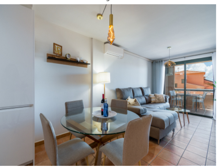
Living area and dining area