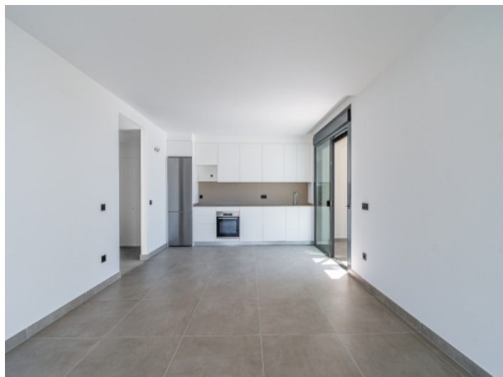
Kitchen and living area