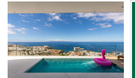
Los Gigantes search for property TEN-107999