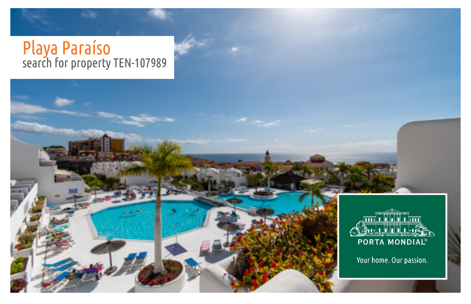
Stunning top floor duplex with ocean view in Playa Paraíso