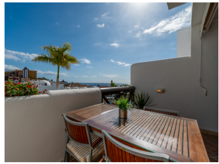
Outdoor dining area