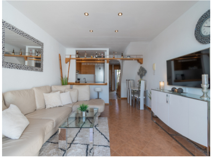
Open plan living and dining area