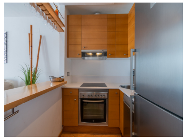
Timeless kitchen design