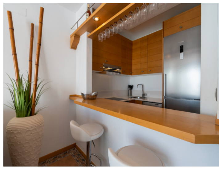
Fully fitted kitchen