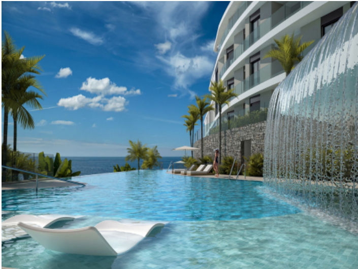
New luxury beachfront apartment in the privileged area of