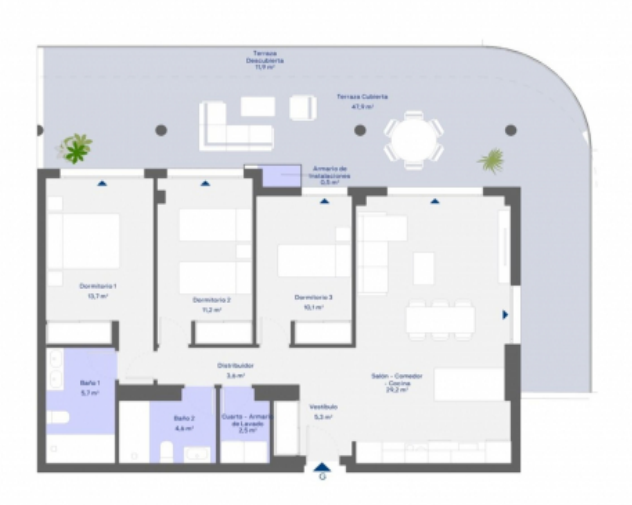
Amazing sea views