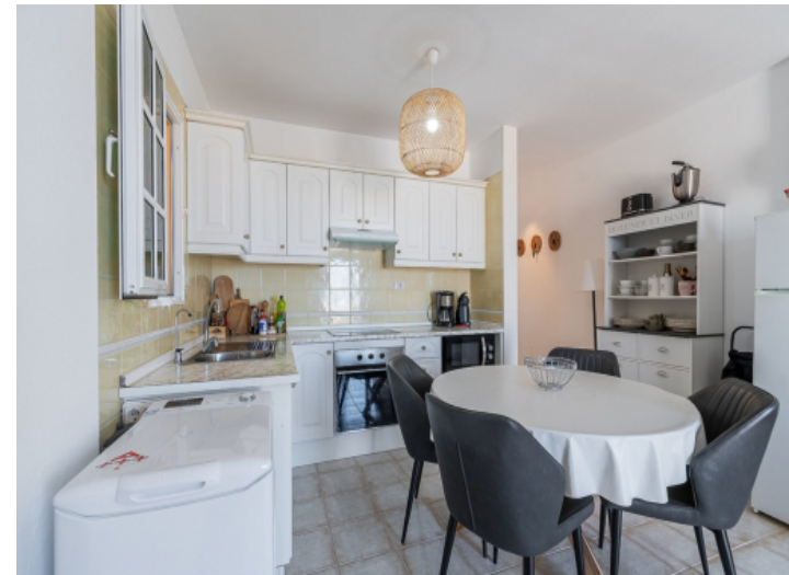
Dining area and kitchen