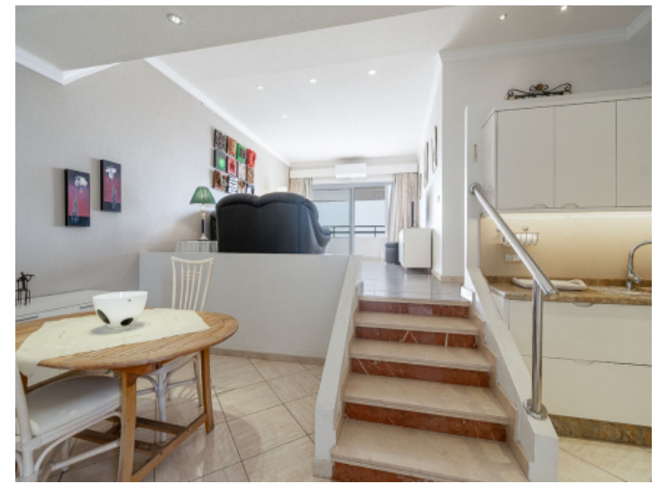
Dining and kitchen area