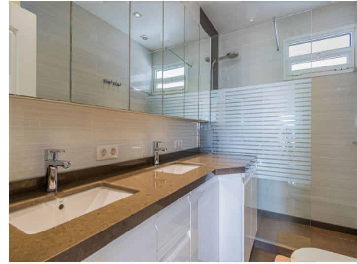
The flat offers 2 bathrooms

PORTA TENERIFE • CALLE LUIS DE LA CRUZ 10, 38400 PUERTO DE LA CRUZ, SPAIN TEL.: +34 922 386 273 • INFO@PORTATENERIFE.COM • WWW.PORTATENERIFE.COM