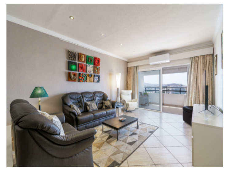
Bright living area