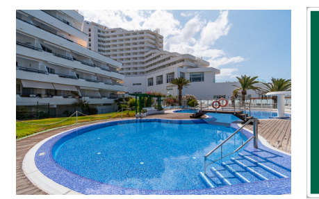
San Eugenio search for property TEN-107940