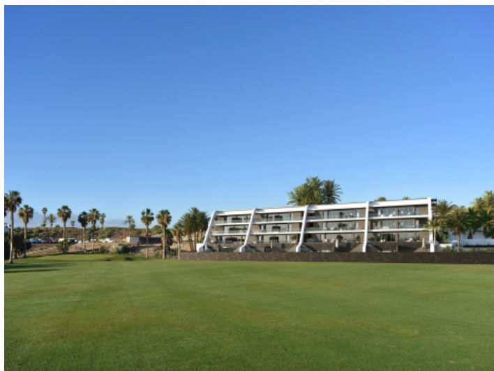
Views to the building