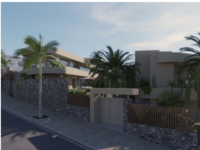
Views from the street