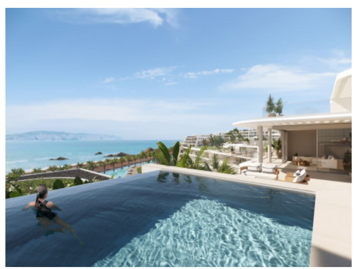
Roof terrace pool