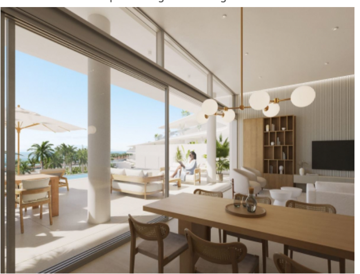
Light flooded dining area