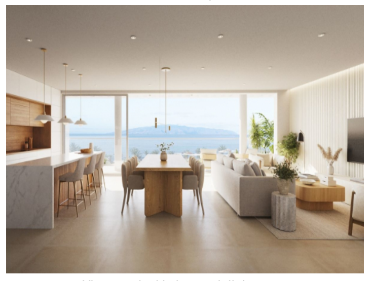
Views to the kitchen and dining area