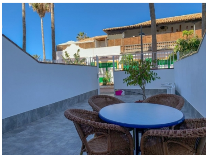
Dining area on the terrace