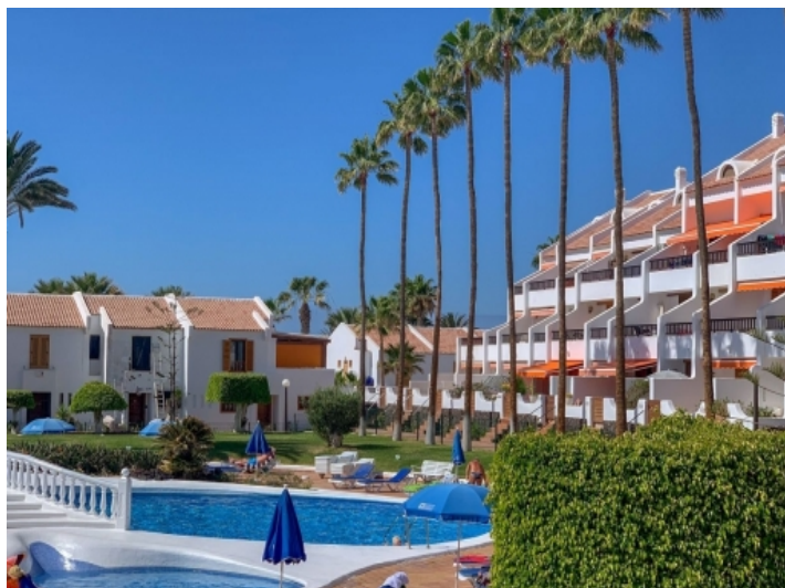
View of the residential complex