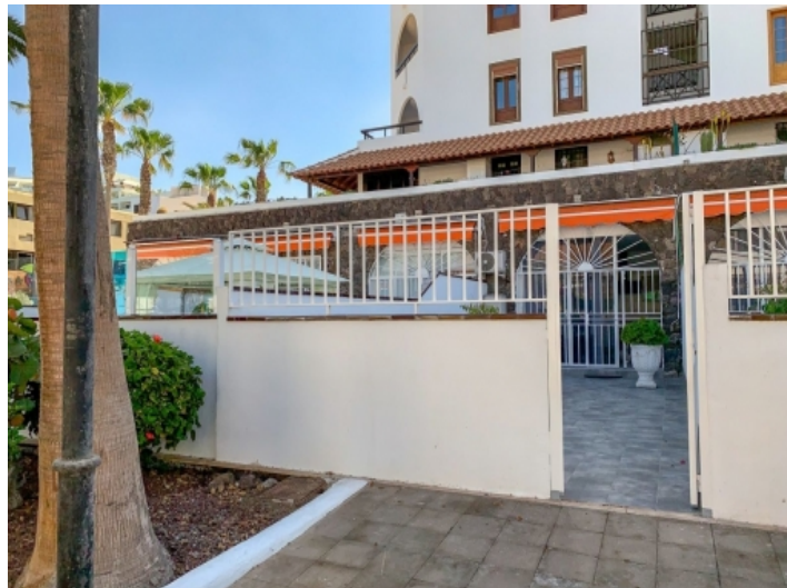
Access to the apartment