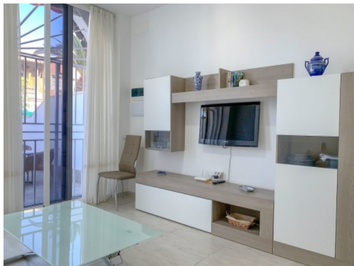
Living area with access to the terrace