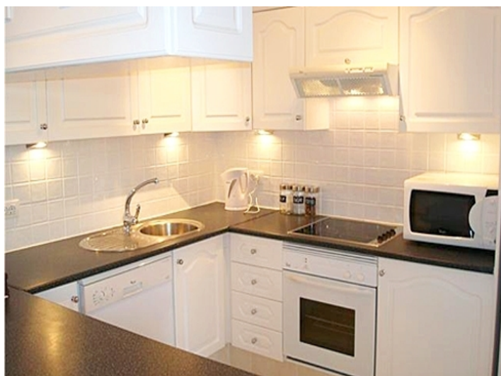
Nice fitted kitchen with electric devices