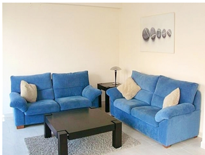
Modernly fitted living room and open plan kitchen