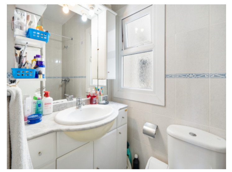
Living area Bathroom