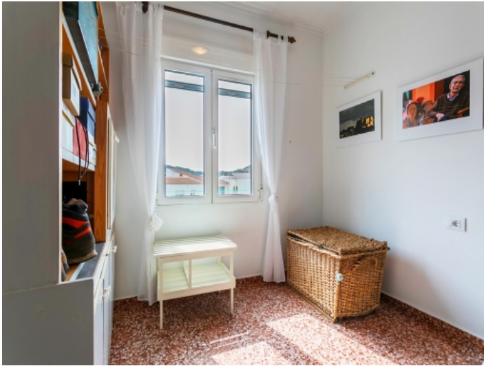
One of 4 bedrooms^