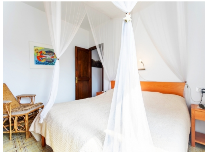
Bright double bedroom