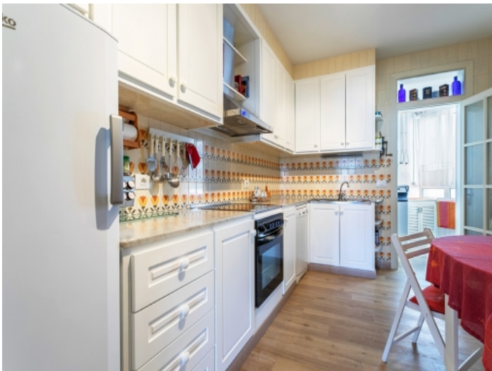
Beautiful kitchen with dining area