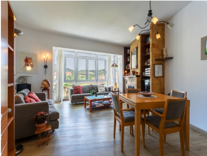
Lightflooded living and dining area