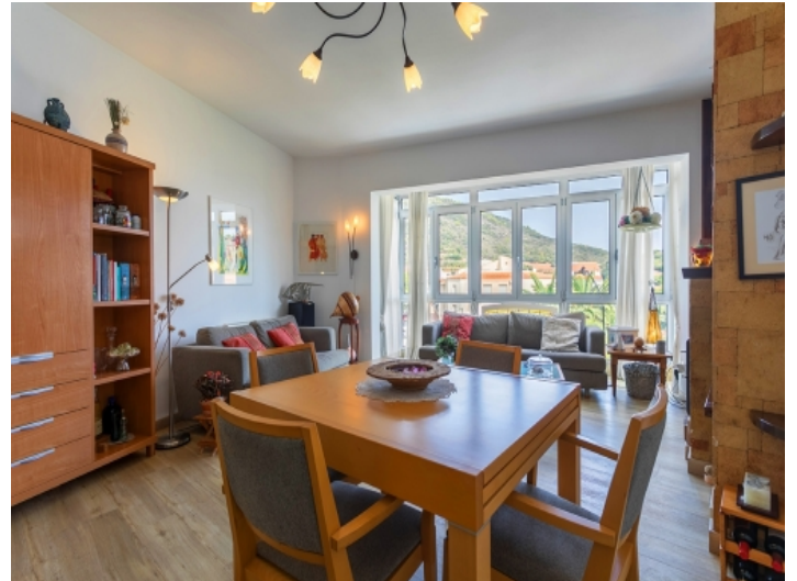
Alternative view of the living and dining area